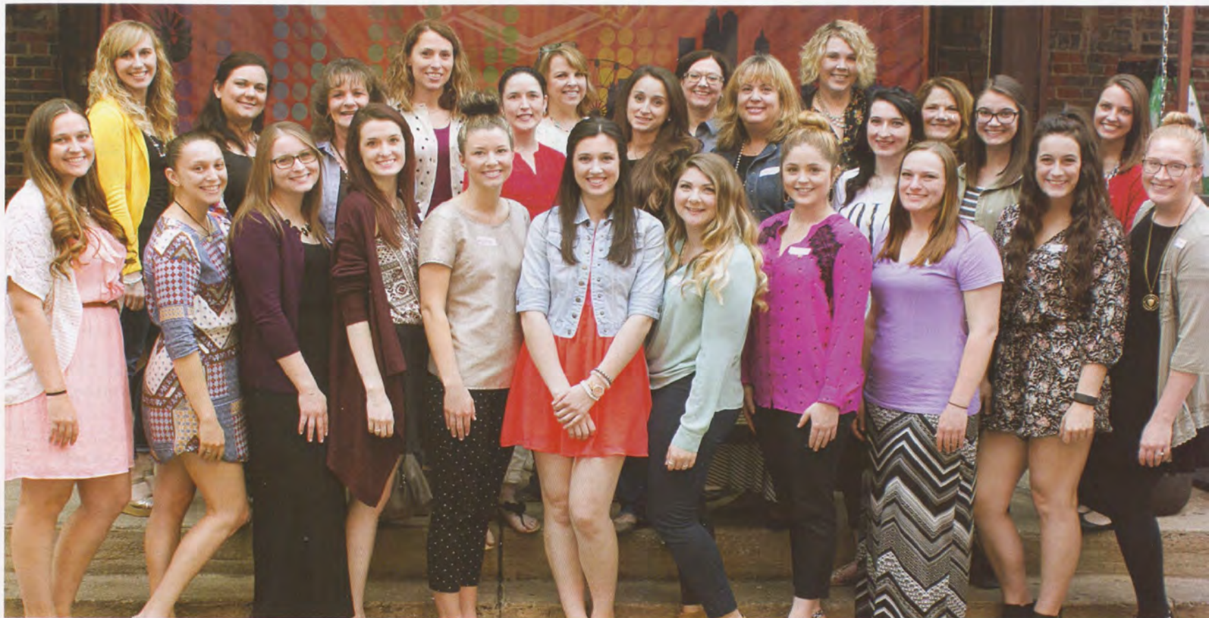
Region 6 | In May, the Wichita Alumnae Chapter welcomed 15 Beta Chi seniors into the chapter with fun and sisterhood. Congratulations to all Gamma Phi Beta graduates!