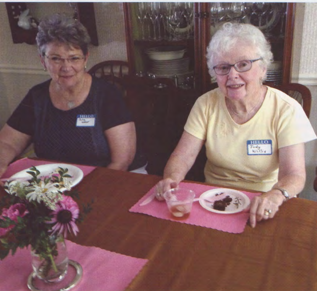
Region 2 | Fairfax Alumnae Chapter members enjoyed a potluck lunch to spend time together and get better acquainted with new members. They are also looking forward to assisting Epsilon Pi Chapter (George Mason) with recruitment.