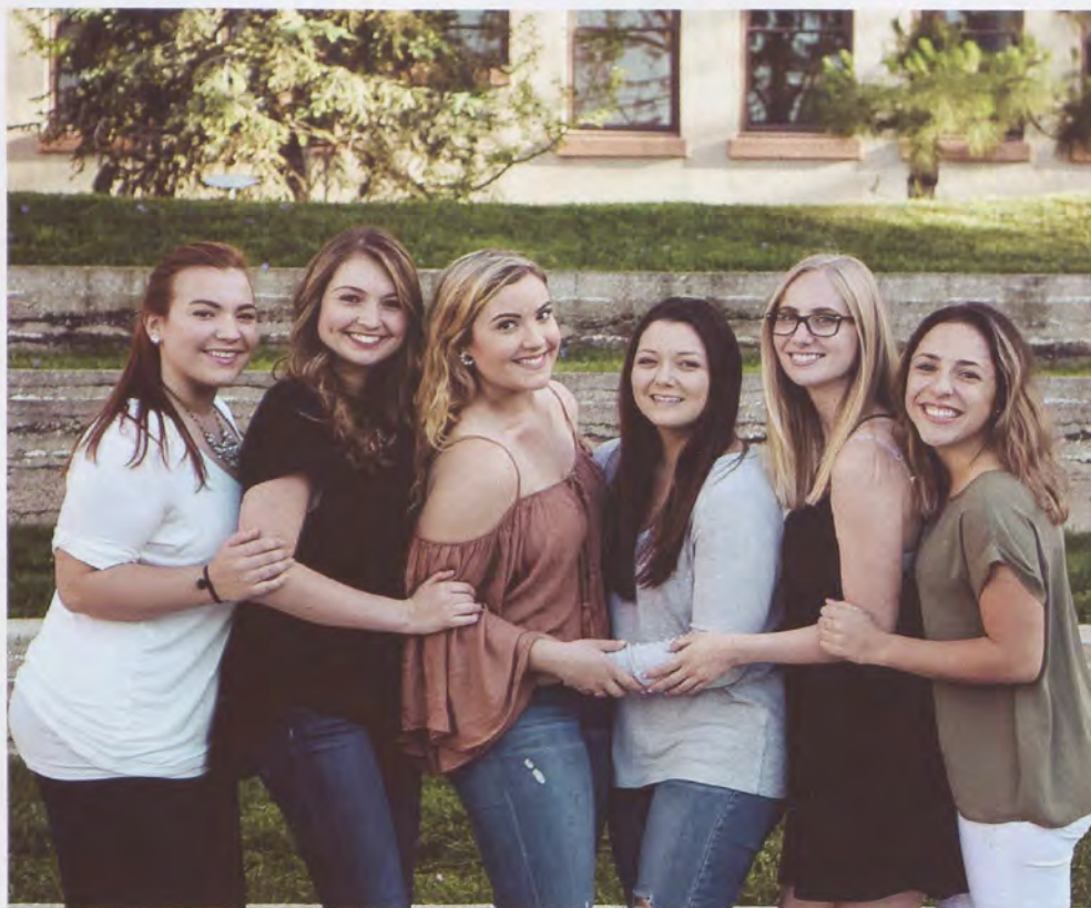
Region 7 | The executive council of Epsilon Nu Chapter is excited to begin another school year after accepting multiple awards at Convention!