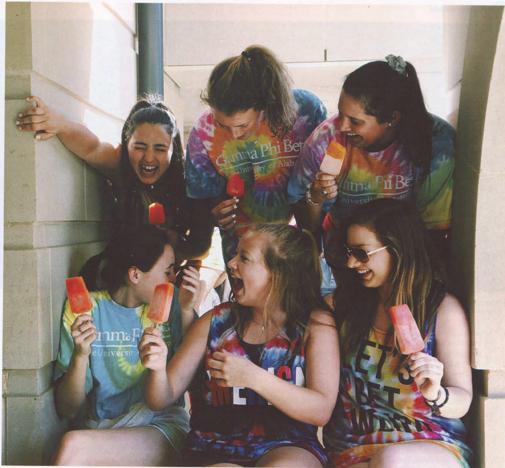
Region 3 | Sisters at the University of Alabama enjoyed a cooling off with popsicles provided by their affiliated house corporation while preparing for recruitment.

This summer, Zeta Chi Chapter was fortunate to send five members of its executive council to Convention in Atlanta. The women were also thrilled to receive a volleyball as recognition for being a pilot chapter for Moonball. As the summer comes