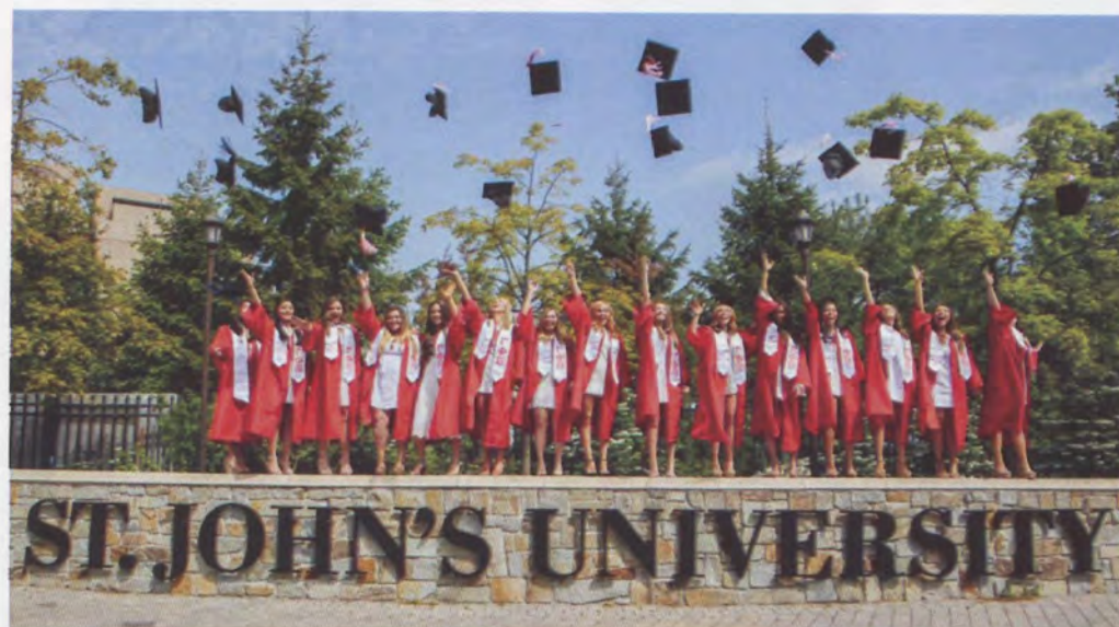
Region 1 | Zeta Mu graduates celebrate the end of their time as collegians as they prepare to become Gamma Phi Beta alumnae and continue the strong sisterhood Gamma Phi Beta has given them.

The chapter helped a sister host a festival to raise money for her mother and other victims of Desmoid Tumors. Zeta Epsilon executive council members also attended Convention