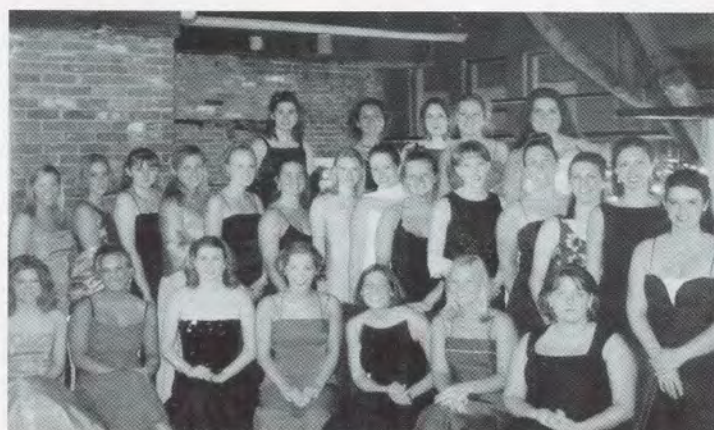
Spring formal at the University of North Carolina/Ashville.