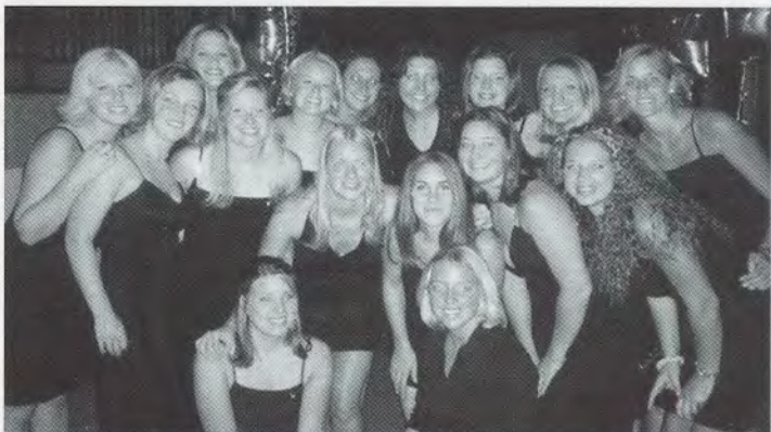
Informal recruitment was a blast for the sisters of Minnesota State University/ Mankato (IT1).

So far this year, these sisters have been busy! Through formal recruitment, they brought in 12 new lovely women. This puts Gamma Pi at Total, and makes them the largest chapter on campus. These sisters have been helping many different organizations, such as the Leukemia Walk, Heart Walk and One