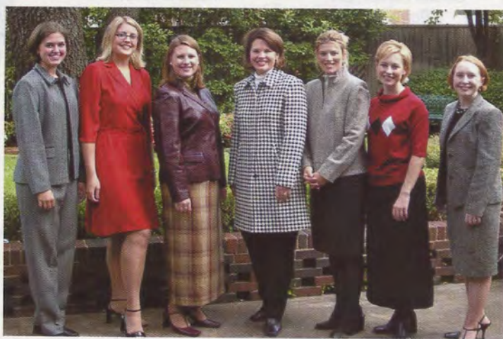
Dallas alumnae at their annual Reassembly Brunch and Fashion Show.