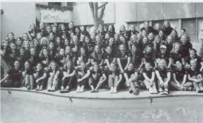
The women of the University of California/Santa Barbara (ΔΨ) at fall recruitment.

The Gamma Psi Chapter had a successful fall recruitment welcoming 20 new members into their sisterhood. Enthusiasm toward the upcoming year was apparent at Fall Retreat, where members participated in crafts (pillow cases for the new members and decoupage vases for all), skits, a song fest and the traditional carnation passing. The girls recently helped the Sigma Alpha Epsilon fraternity with their annual Red Cross Blood Drive, and are looking forward to two of Gamma Psi's annual philanthropies: face and pumpkin painting at a nearby pumpkin patch and a breast cancer run/walk.