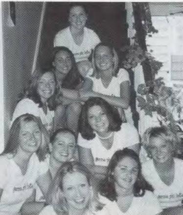
University of Illinois (O) sisters pose before the Open House stage of Recruitment.