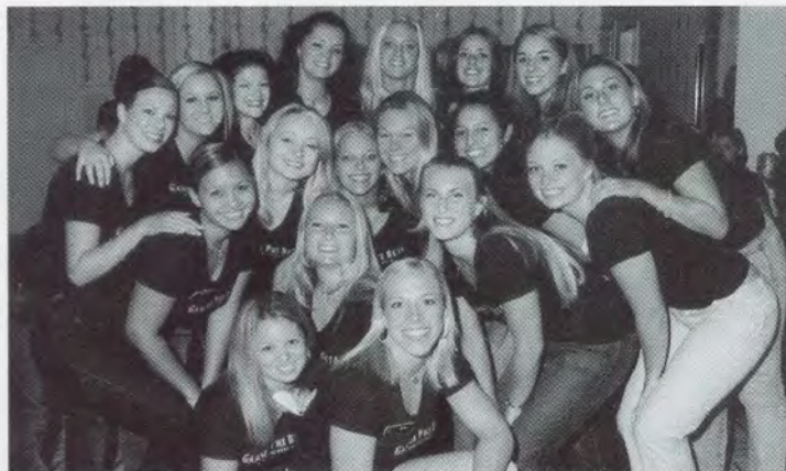
Sisters at the University of Southern California (BA).

The sisters at Bowling Green were proud to receive the Spirit Award at the recent Beta 500 event. They had to prove their spirit in order to receive this award which they did with balloons, posters, cheers and a great deal of enthusiasm!