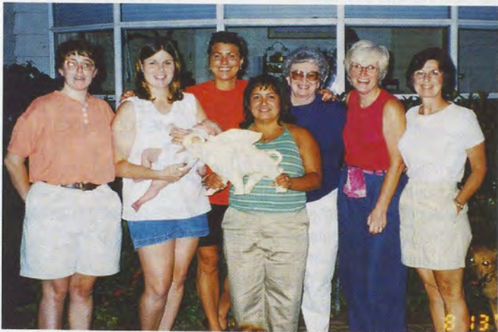
Kent alumnae enjoy another white elephant auction during a summer picnic.

The PHILADELPHIA WEST SUBURBAN Alumnae Chapter is off to a great start. The alumnae enjoyed learning some history about early Philadelphia from a local historian during their first