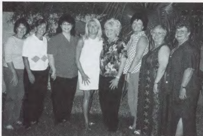
Las Vegas Valley alumnae at their summer barbecue in July.

Coming from as far away as Knogsberg, Norway, several sisters from SYRACUSE, class of 1951, reunited to celebrate their Golden Anniversary. It was proven once again that the bonds of sisterhood grow and strengthen long after the college years.