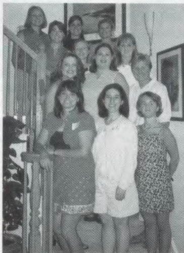
Dallas alumnae at their summer party in June.