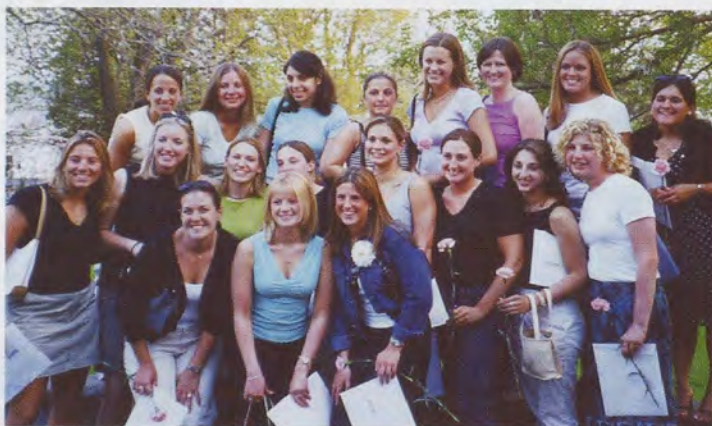
Syracuse University (A) class of 2001 at their Senior Supper.

Forty-one new members were welcomed at the University of Nebraska! The chapter looks forward to a crazy year including a Camp Phire philanthropy to benefit a local elementary school and YMCA camp, a Hawaiian party and a $5 prom! The sisters also continue to collect money before the Husker games to support Special Olympics.