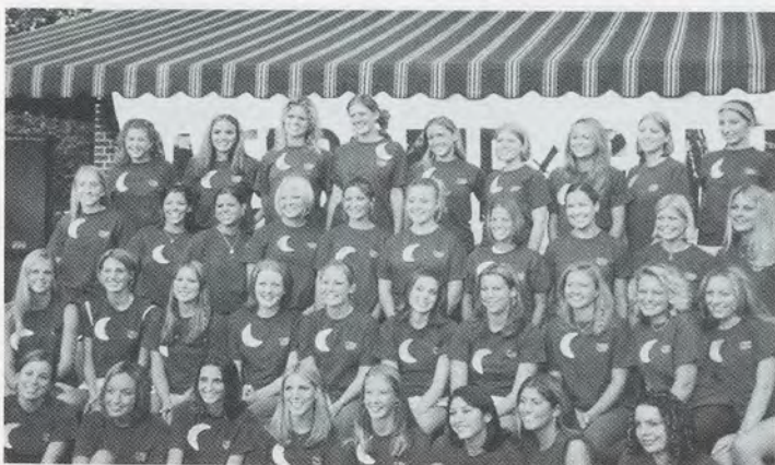
The new member class at the University of Iowa (P) at their Bid Day barbecue.

The sisters at Southern Methodist University hosted several alumnae for a brunch and fashion show this fall. The chapter also celebrated Family Weekend by enjoying a breakfast and then tailgating with their families prior to a football game.