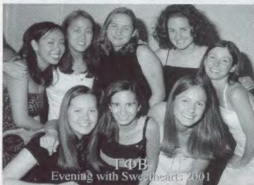
Sisters of the Univ. of CA/Los Angeles (AI) at their formal.