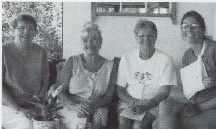
Hawaii alumnae take a swim and then enjoy lunch at their June meeting.

ST. LOUIS alumnae ended their summer break with a wine and cheese party. October's event will be held in a historical mansion.