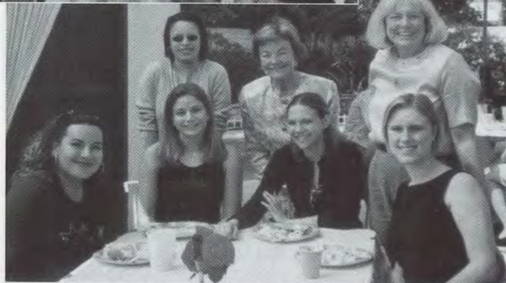
ABOVE PICTURES: San Fernando Valley and Pasadena alumnae gather for Zeta Theta's Senior Celebration.