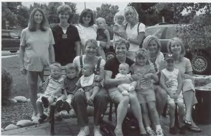
Gamma Phi sisters from Colorado State University (T) pledge class of '88 gather for a reunion with their growing families.

FT. MYERS alumnae proudly report two sisters at Florida State University are this year's recipients of Panhellenic scholarships.