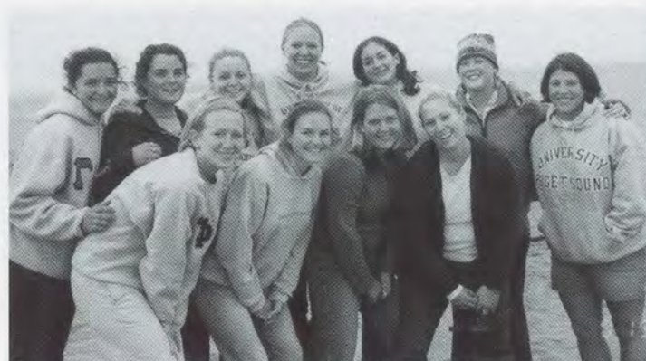
Women at the University of Puget Sound (PE) enjoy time on the beach at their officer retreat in the fall.

The sisters at the University of Colorado welcomed 55 new members to their chapter this fall. The sisters are now gearing