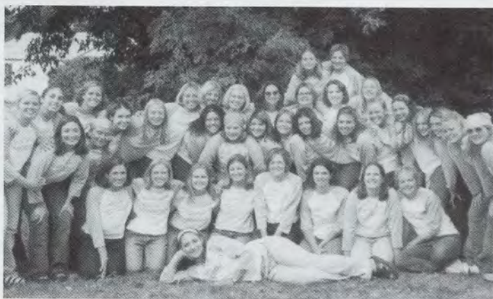
Bid Day was a blast for the ladies of Minnesota State University/Mankato (ΓΠΙ).

The sisters at Sonoma State University did all that they could to support the effort in New York. They took part in a blood drive, collected donations and handed out ribbons. A powder puff football event raised over $1,000. All proceeds benefited the United Way.