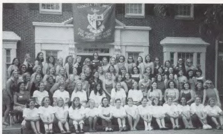
The ladies at the University of Alabama (EA) welcome their new sisters!

Fall recruitment was a huge success as the chapter welcomed over 20 new members forming their Alpha Epsilon class. Activities this quarter include a weekend retreat at Goleta