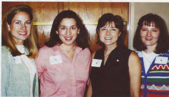
Members of the Texas Initiative Steering Committee pose at Crescent State Day.