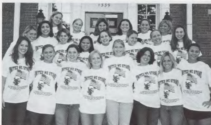
Sisters from the University of Kansas (Σ) showing their support of our great nation.