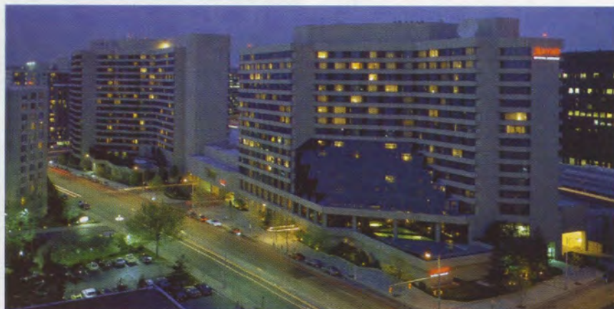
2002 CONVENTION HOTEL SITE: Crystal Gateway Marriott