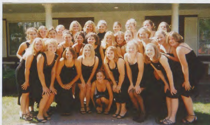
Sisters at the University of Idaho (Xi) on Preference Day.