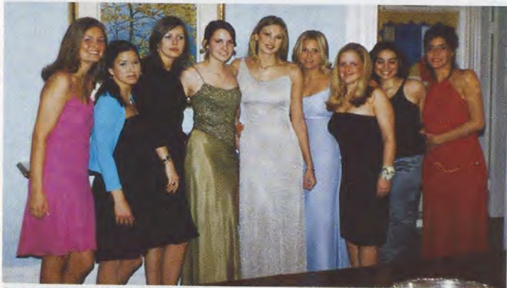
Sisters at the University of Toronto (AA) before their spring formal, the Carnation Ball.

The ladies of the Delta Delta chapter have been busy this semester. Thirty new sisters joined the chapter this past fall. Bid Day included a live band and great food. The ladies, along with all of the other Greeks on campus, held a fundraiser to contribute to the September 11 fund. They also had a six-way mixer with the sisters from Chapman University and CSU/Long Beach, along with the ΣAE fraternities from those schools.