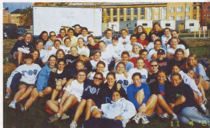
ΓΦΒs at Gettysburg College (ΓΒ) pose at their "Love of Lori" softball tournament.