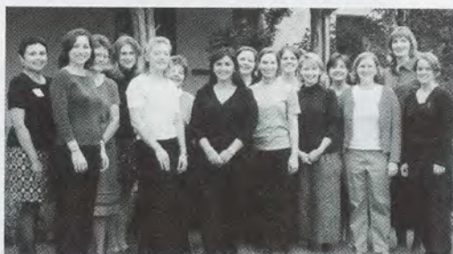
Gamma Phis at the Austin, TX alumnae chapter installation on November 11, 2001.