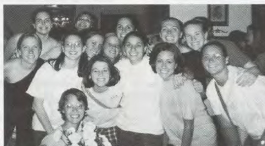
Sisters at the University of Georgia (ΔΥ) couldn't stop smiling after finding out they had made quota.

Once you start this process, the easier it will become. Remember an emphasis on superior scholarship will assist you in recruiting quality women who will be life long members of our Gamma Phi Beta sisterhood. If you want additional ideas, contact your Province Membership Director or the Director of Collegiate Recruitment. ■