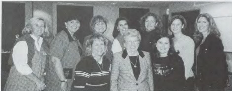
Members of the Balboa Harbor Alumnae Chapter at their 2001 Founders Day.