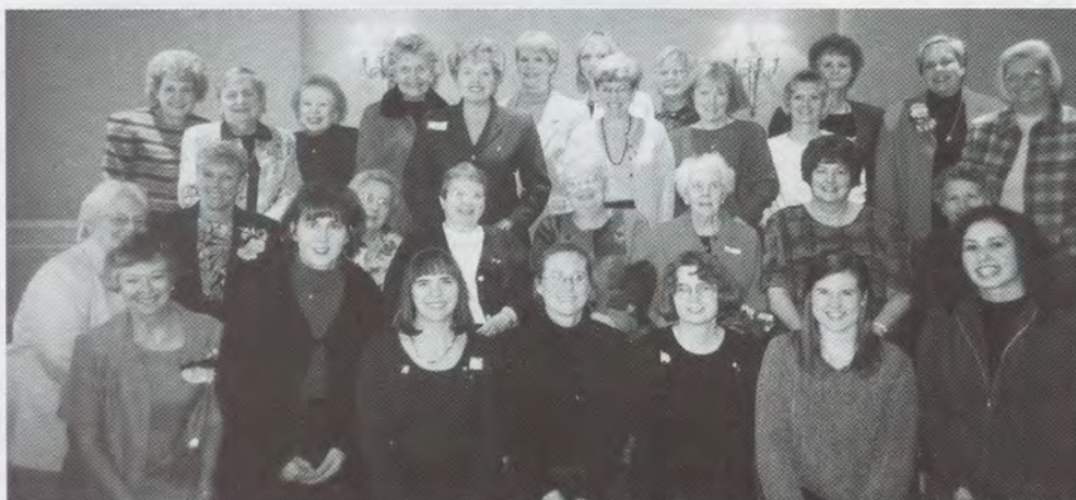
Founders Day with the Cleveland East and West Alumnae Chapters.