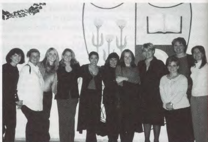
Long Beach, CA alumnae pose for a picture on Founders Day.

The CHICAGO NORTHWEST SUBURBAN alumnae hosted this year's Chicago Area Founders Day celebration. Twenty-eight sisters joined the Mystic Circle from three alumnae chapters. Eighteen collegiate chapters were represented. The alumnae enjoyed their annual holiday party and silent auction this December where $800 was raised to benefit Girl Scouts.