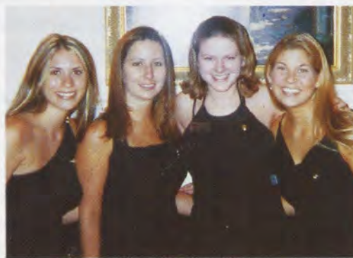
Florida State University (BM) sisters at recruitment.

The sisters at Oakland University welcomed 11 new members following fall recruitment. The chapter enjoyed a camping retreat where they became better acquainted with their newest members. The chapter took part in a "mudbowl" and made front-page news for their sponsorship of Safe Sex Week.