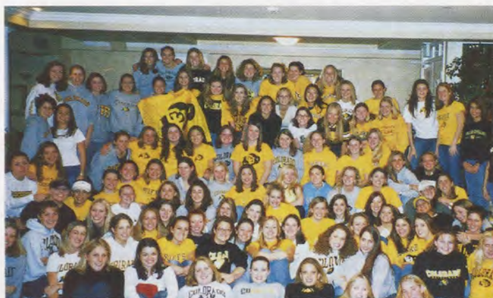
The University of Colorado/Boulder (BP) chapter poses for a house picture.

The sisters of the Epsilon Beta enjoyed their time together at their haunted house pre-recruitment event, Goo Phoo Boo. In November, these sisters held their local tradition of Tavern. This is an all campus, semi-formal fundraiser that usually raises money