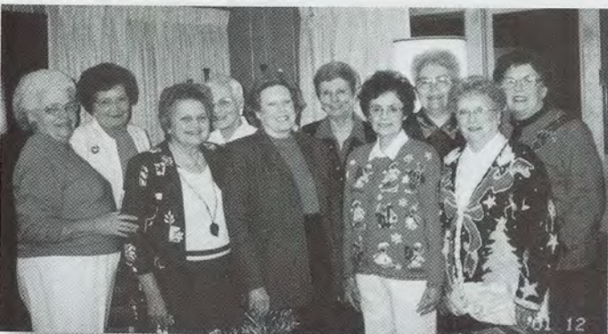
Members of the Peoria, Illinois Alumnae Chapter with their 50-year awards.