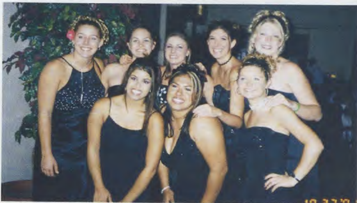
The Spring 2001 new member class at Arizona State University (BK) enjoying their first Crescent Ball.