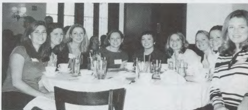
Members of the University of California/Santa Barbara (ΔΨ) at the Founders Day Luncheon with alumnae.