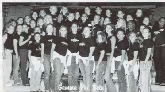
Pepperdine University (ΖΘ) sisters at their 2001 Bid Day.