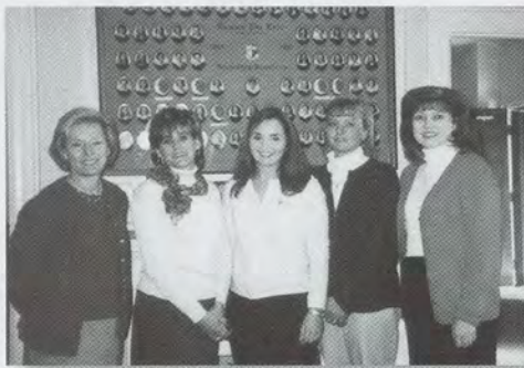
Founders Day guests at Wittenberg University.