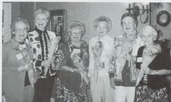
The 60- and 70-year members of the Sun City, Arizona area who were recognized in November.