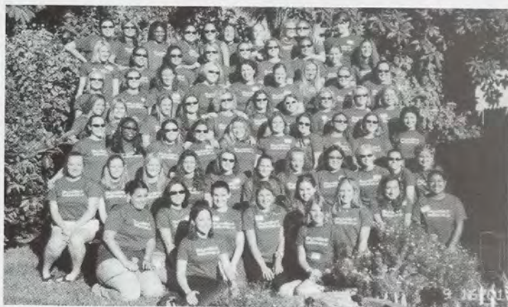
Thirty-five new members were welcomed at Chapman University (EN) this fall.