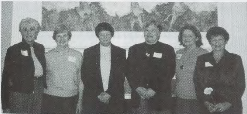
50-year members of the Seattle Alumnae Chapter at their Founders Day at the Lambda chapter house.