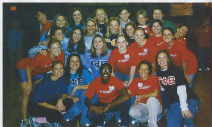
Iowa State University (Ω) sisters at their 15-hour, Annual Dance Marathon.

The sisters from Penn State took part in a 48-hour dance marathon this past spring. This is the largest student-run philanthropy in the world. The chapter was responsible for $76,000 of the $3.6 million donated to fight pediatric cancer. The sisters held their own successful Kickball Classic philanthropy and welcomed Spring Week with members of Alpha Epsilon Pi.