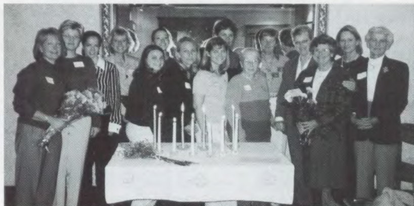
Founders Day guests at Wittenberg University.