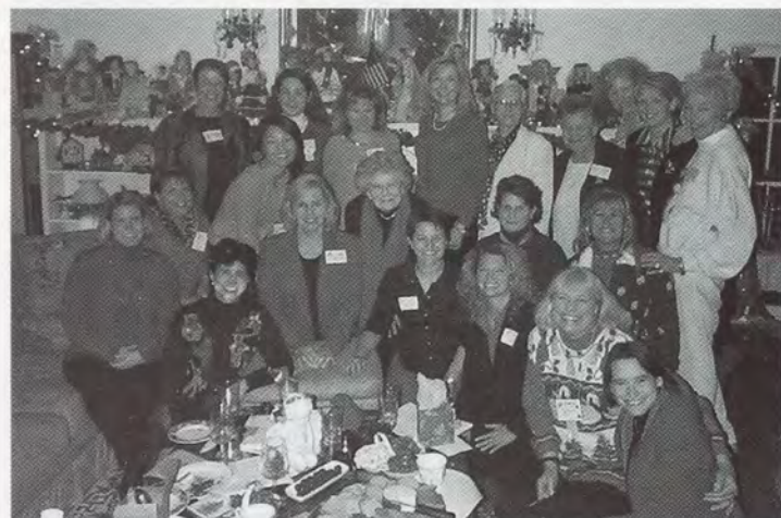
The Pasadena Alumnae Chapter at their Christmas Party in December 2001.

SACRAMENTO'S Capital City Crescent Circle has recently reorganized and recruited alumnae members in hopes of becoming an alumnae chapter. The group enjoyed Founders Day with sisters from California State University/Sacramento. Upcoming events include a Panhellenic luncheon and other fun activities.