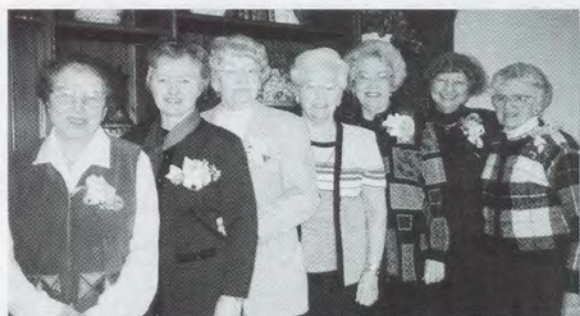
Members of the Lima (OH) Crescent Circle at their spring luncheon in late March where these seven 50-year sisters were honored.