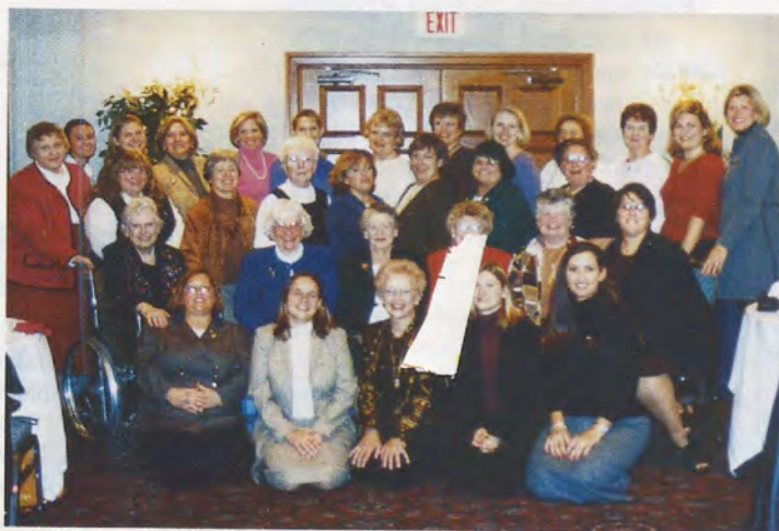
The Philadelphia West Suburban Alumnae Chapter celebrates Founders Day.