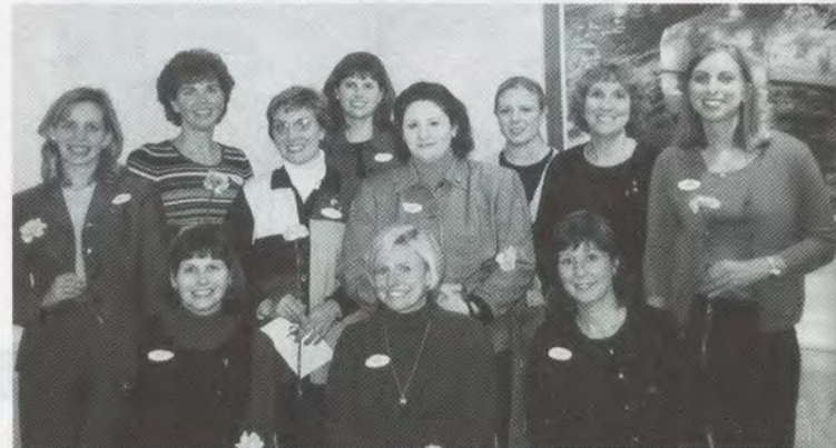
The Reno alumnae Founders Day.