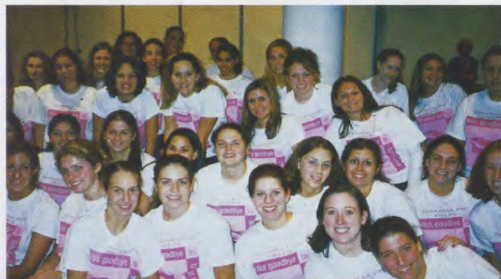
Syracuse University (A) members during their "Kiss Goodbye to Breast Cancer" campaign in October.