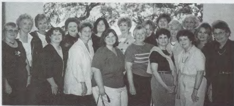
"Gamma Phi Beta Founders Day Travelers" at Oak Alley Plantation, New Orleans, LA, November 7-12, 2001.