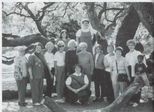
"Gamma Phi Beta Founders Day Travelers" enjoying the scenery at Oak Alley Plantation.