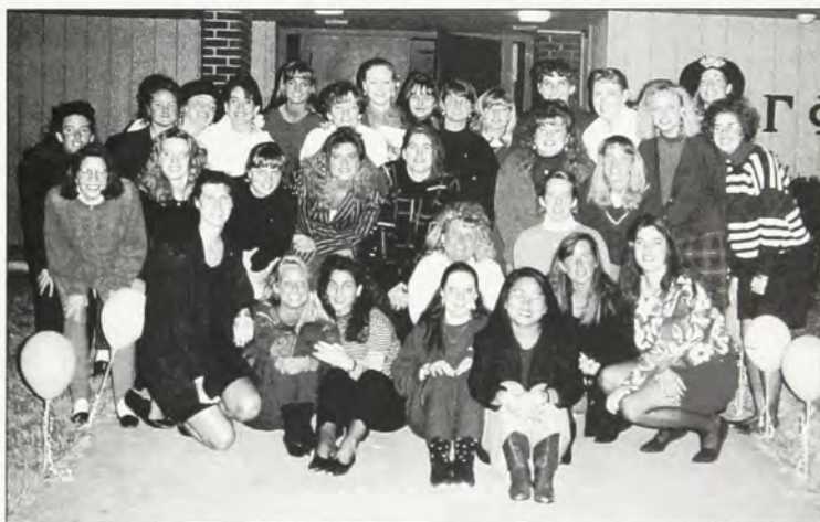
Sisters at Wichita State celebrate the chapter's 35th anniversary.

University of Denver sisters initiated their 28 new members in November and held two philanthropic events. The first event benefitted Warren Village, a residential community for single parents. Sisters