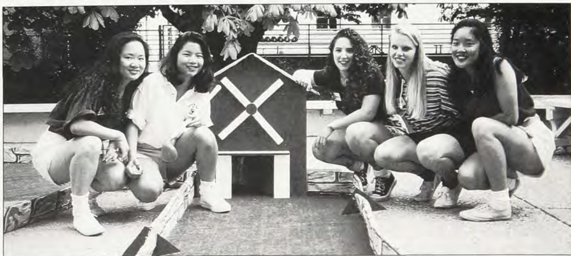
Sisters from the University of California, Berkeley pose during membership recruitment.