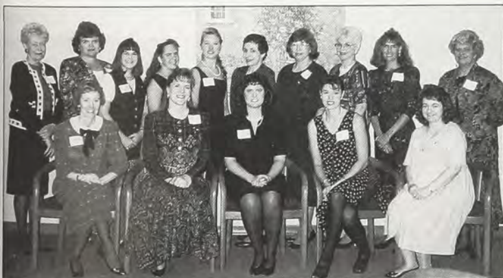
The Orlando/Winter Park alumnae, riding on the coattails of Gamma Phi spirit from '94 Convention, have held several events revitalizing the alumnae support in the area. From a reacquaintance lasagna dinner, Founders Day celebration and a Christmas exchange, the bonds of sisterhood were renewed. Many more activities for the spring have been planned including a fundraising program to benefit Central Florida's Camp Challenge.

One hundred and twenty years of sisterhood and friendship were celebrated by the San Diego and La Jolla alumnae chapters and collegiate chapters from San Diego State and the University of San Diego.