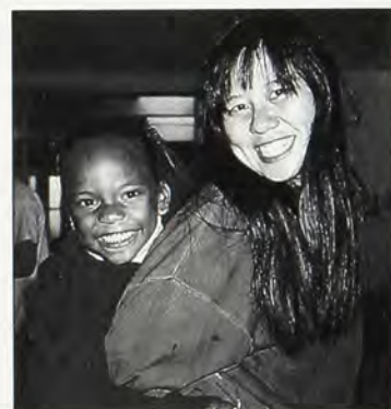
Sisters from the University of California, Berkeley, host a Halloween party for 13 boys and girls from the Clay Street Shelter for homeless children.

The Delta Tau Chapter at Colgate University successfully completed the university's first sophomore rush. The chapter's theme party, "The Crescent Casino" was a huge success. The Alumnae Relations Committee set up a special committee to put together a Terrorism Awareness Panel Discussion. Gamma Phi will be the main sponsor of the panel, to which senators from New Jersey and New York have been invited.