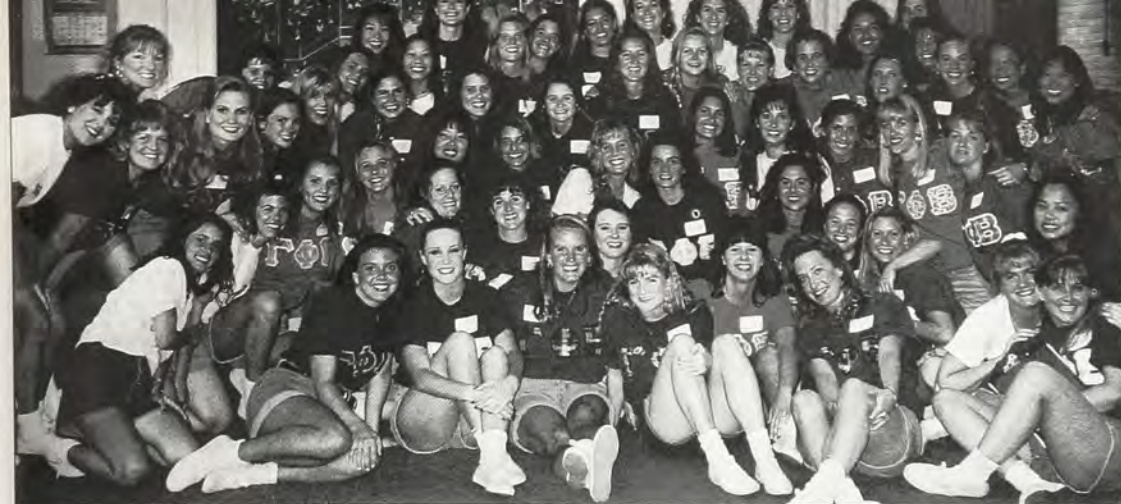
Sisters from Moorhead State pose during membership recruitment.

babysat children while their parents attended parenting classes. Warren Village provides a new start for families to help them get off of welfare. The second philanthropy, "Into the Streets" saw a dozen Gamma Phi volunteering all day at a local elementary school.