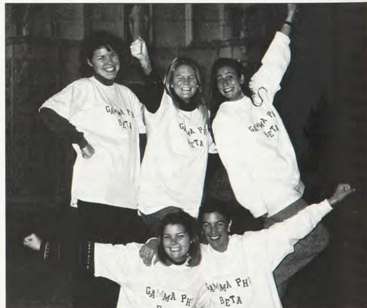
The University of San Diego chapter presents their five new members!