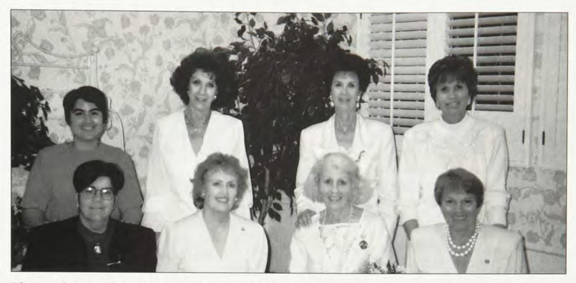
The South Bay Alumnae Chapter welcomed four new alumnae initiates last December.