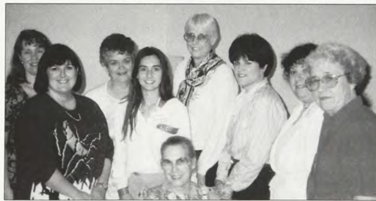
Members of the Southeast Missouri Crescent Circle celebrate Founders Day together.