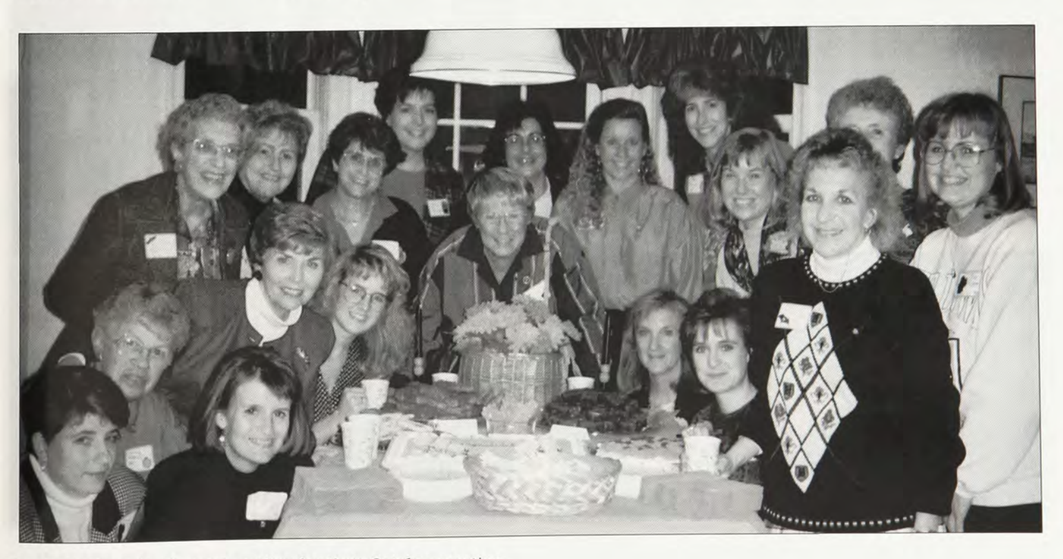
Northern Virginia alumnae gather for their October meeting.

Over 70 Houston alumnae and guests celebrated 1993 Founders Day in style at a luncheon and fashion event. The guest speaker comically presented the "dos and don'ts" and the "befores and afters" of fashion. On a more serious note, an exclusive Houston custom design house, using Houston alumnae as models, displayed some of the hottest new looks