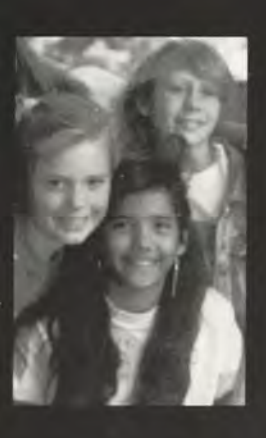
Gamma Phi Beta Foundation

Gamma Phi Beta sponsored camps ... where kids can be kids.