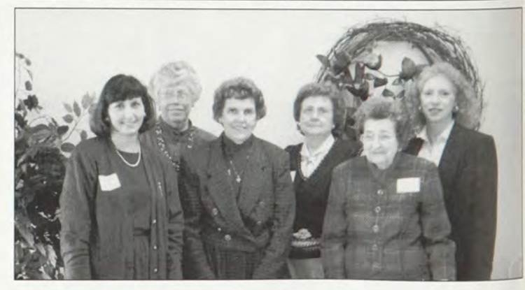
The revitalized Pomona Valley Alumnae Chapter held their first meeting in October.