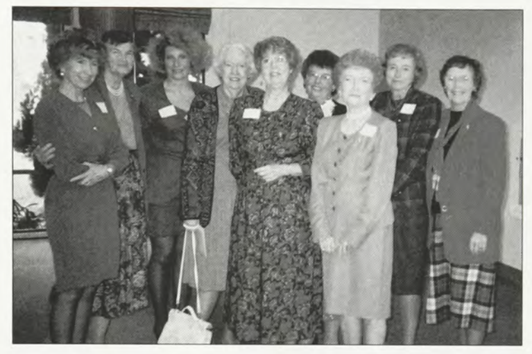
San Diego and LaJolla Alumnae Chapters presented 10 IIKE awards to outstanding alumnae at their Founders Day celebration last November.

house at Denver University and a fundraiser for special camping for girls are a couple of their activities scheduled for spring.