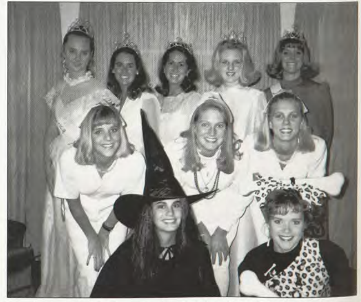
Northern Iowa collegians dressed for the all-Greek Halloween party.

The holiday season found University of Kansas sisters out in the community volunteering at nursing homes, cutting coupons and gift wrapping. The sisters are gearing up for a successful Greek Week which will include a talent show, canned good collection and many sports. The sisters social calendar includes Mom's Weekend, a Kansas City Royals Date Dash and Spring Formal.