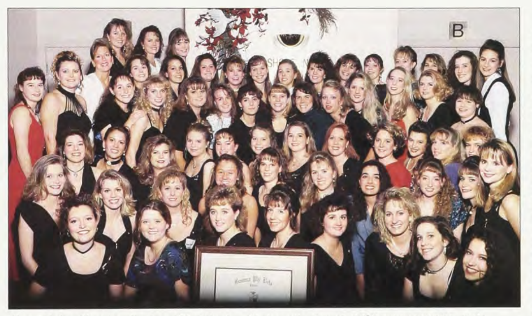
Zeta Alpha Chapter, Eastern Washington University, boasted 60 new initiates at its installation banquet on November 13, 1993.

Last fall the Eastern Washington Colony went through its first formal rush as Gamma Phi Beta Sorority. After a long rush school and many song practices, the chapter took quota and 14 women were added to the group, making Gamma Phi Beta the largest sorority on campus!