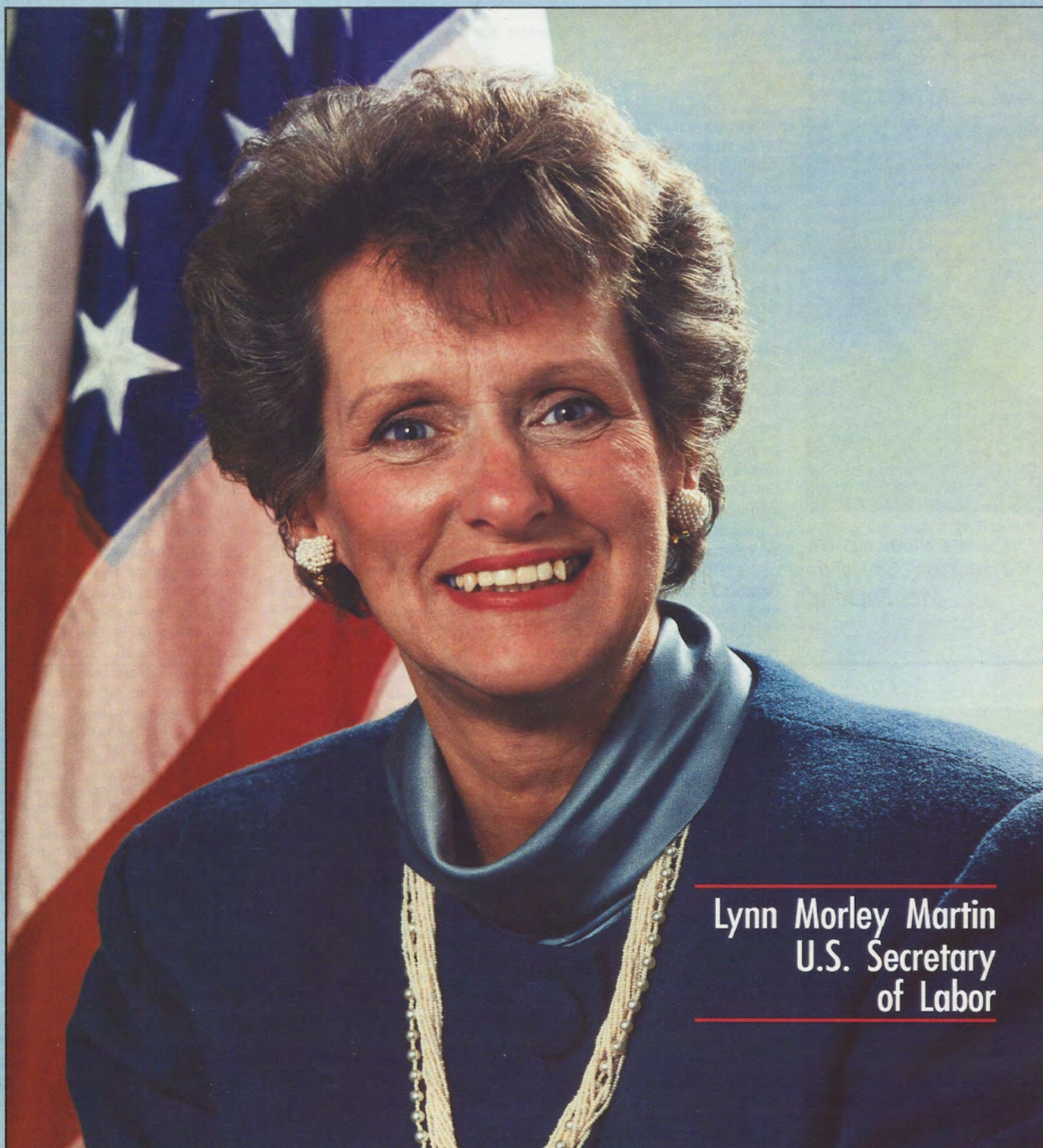
Lynn Morley Martin U.S. Secretary of Labor