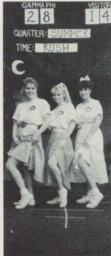
UCLA sisters show their spirit during rush.