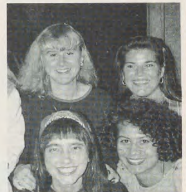
Big and little sisters share sisterhood at the University of Wisconsin-Milwaukee.

Excitement, sisterhood and learning described Inspiration Week at Kansas State . A pizza party, sharing feelings, roller skating and studying together were all part of the week's activities. After initiation they enjoyed Celebration Day with movies, lunch and a disco party.