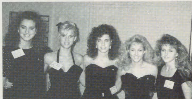
East Texas State members are ready for their Preference Party to begin.