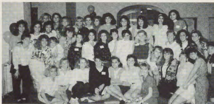
Sisters from the three Arizona chapters attend Leadership Conference.

To break the ice and introduce themselves, they went on a scavenger hunt and also enjoyed raffling t-shirts from each chapter.