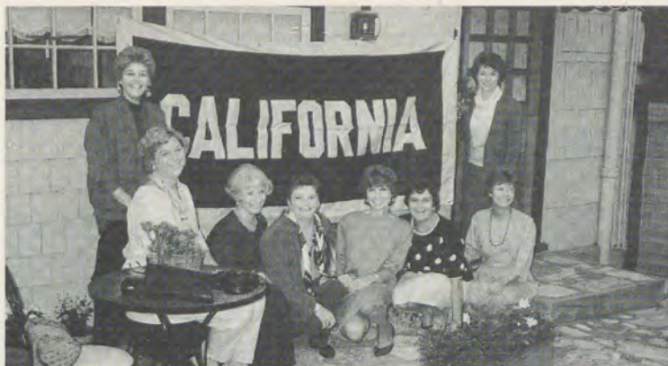
University of California-Berkeley alumnae attend a 30-year reunion.