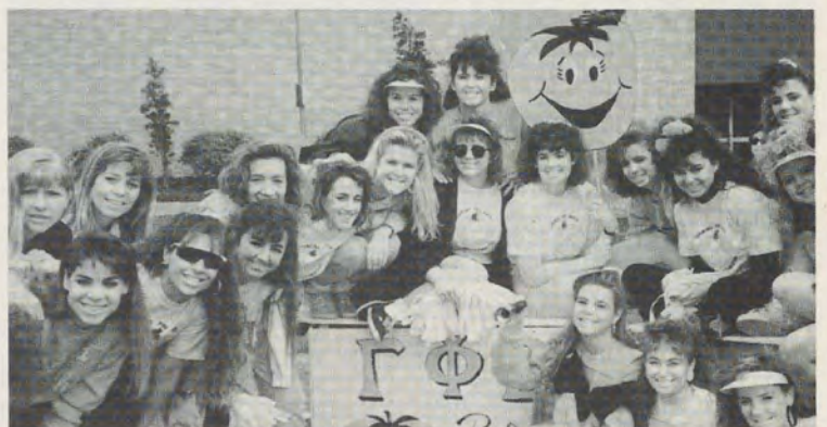
Greek Week brings out the smiles at California State-Fullerton.

Beta Beta Chapter at the University of Maryland celebrated its 50th anniversary with a reunion on homecoming. Alumnae enjoyed looking at composites from years past and visiting the rooms where they once lived. They reminisced and helped give the members a sense of their chapter's history.