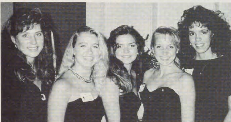
University of Kansas Gamma Phi Betas eagerly anticipate their Preference Party.

Vanderbilt collegians welcomed new pledges in January, and in February passed out candy and hearts at a children's hospital and attended the Pink Carnation Ball. Chapter families began journals and record books with family trees during a PACE activity.