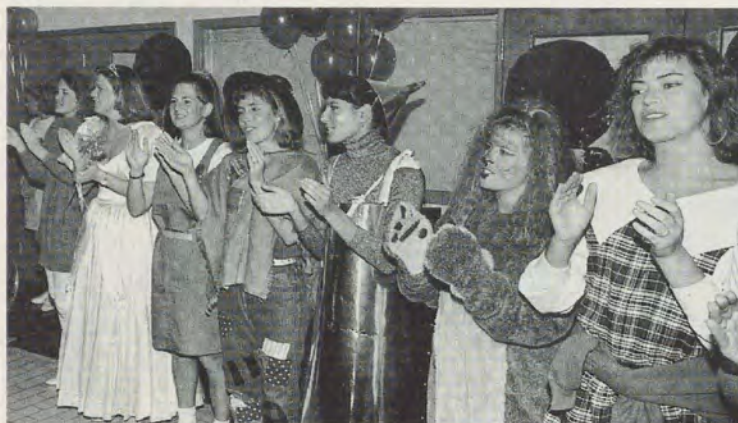
University of Puget Sound Gamma Phi Betas perform their Wizard of Oz rush skit.