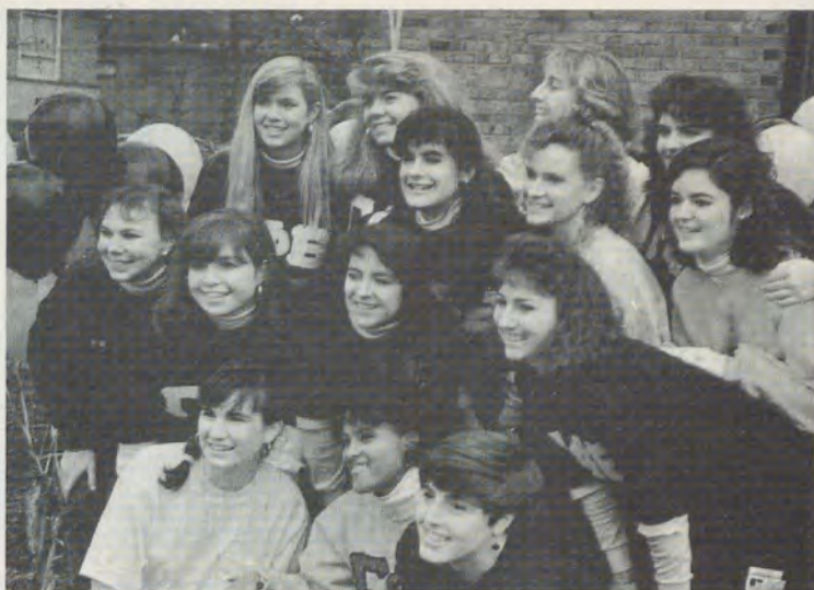
Vanderbilt University collegians celebrate bid day.

Poodle skirts and ice cream sodas set the tone for Union College's '50s Night during rush. Hollywood Night also captured the attention of rushees.