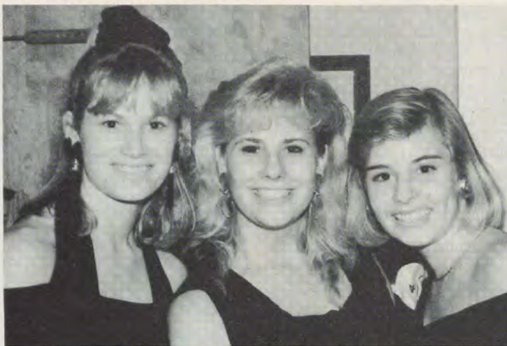
Chapter unity was the focus of a pledge-initiate party at UCLA.

Members of Alpha Epsilon Chapter at the University of Arizona hosted sisters from Arizona State and Northern Arizona at the 1991 Leadership Conference.