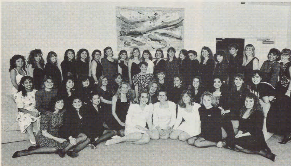
February 2, 1991 was a day of celebration for Epsilon Tau Chapter charter members.