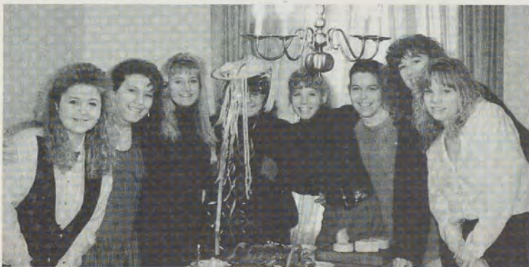
George Mason Gamma Phi Betas hold a surprise wedding shower for a sister.

Gamma Phi-esta, Tea Party with Gamma Phi Beta and Jersey Night helped Chapman College collegians pledge quota. Pledges found their big sisters at a special candle passing ceremony. Movies and scavenger hunts were among their Girls Night Out activities. The