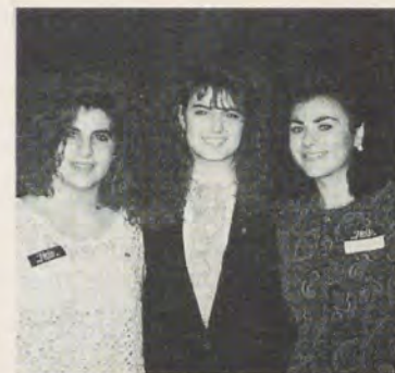
LaSalle University sisters celebrate Founders Day.