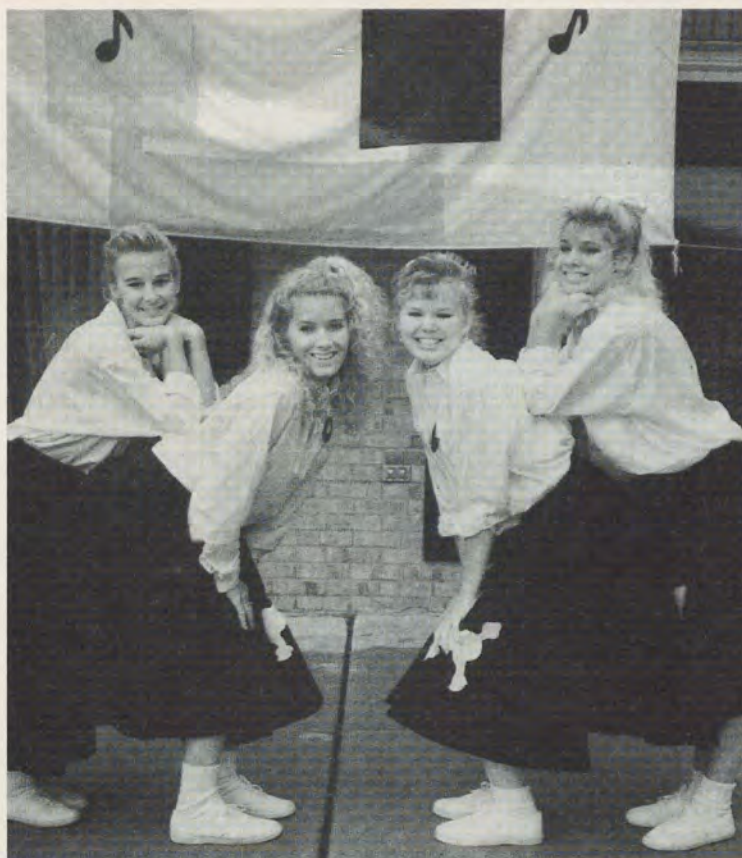
Music and an Elvis look-alike are part of Illinois State's '50s rush skit.