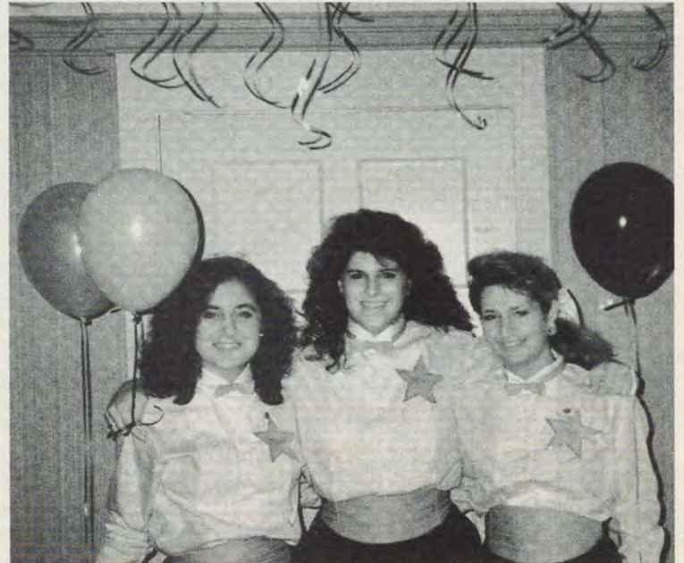
Balloons and Broadway equal a successful rush skit for Oregon Gamma Phi Betas.