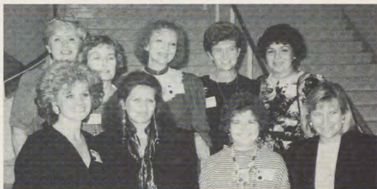
Homecoming at Kent State also was a reunion for members of the 1961-66 pledge classes.