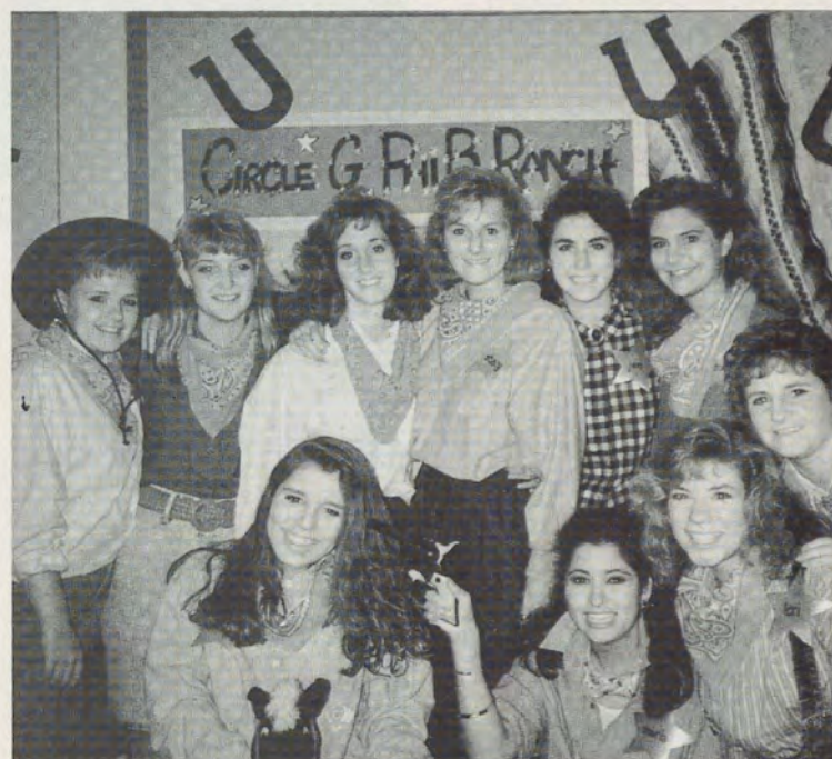
Rush at Penn State includes the Circle G-Phi-B Ranch party.