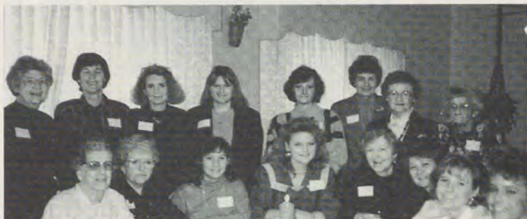
Ft. Collins, Colo. alumnae and Colorado State collegians celebrate Tau Chapter's 75th anniversary.