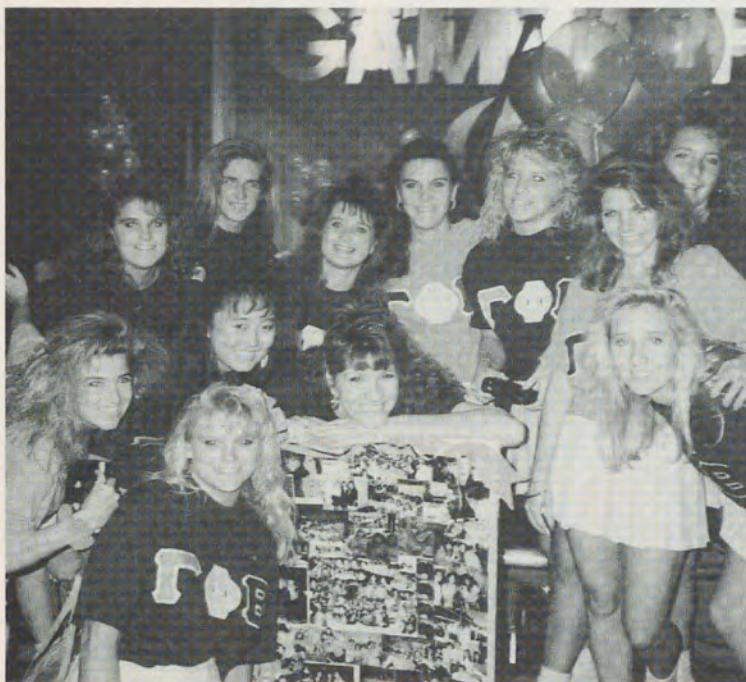
A collage of color awaits rushees at Arizona State.