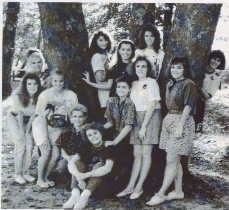
Morehead Gamma Phi Betas enjoy a scenic campus setting during Parent's Weekend.