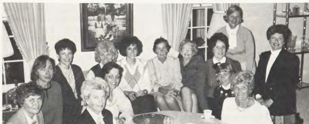
New Jersey alumnae from the Metropolitan and Bergen County groups hold a joint meeting.

With membership at an all-time high, the Chicago NW Suburban chapter had one of its most productive and enjoyable years, according