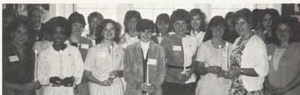
Beta Chapter (Michigan) seniors are honored by Ann Arbor alumnae.