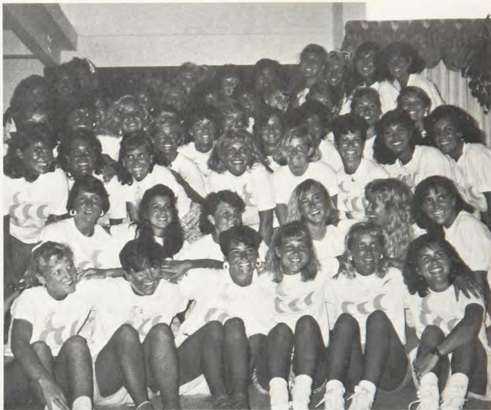
San Diego State pledges wear their first Gamma Phi Beta T-shirts.