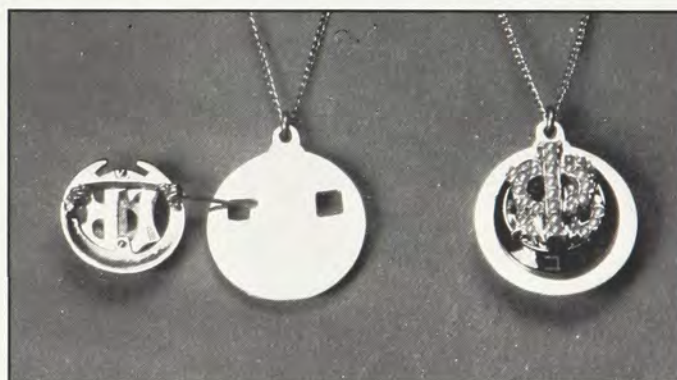
Sterling Silver $40.00