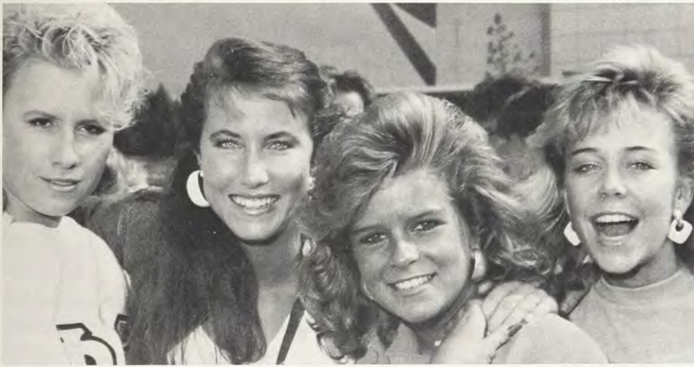
Colorado State members welcome new pledges to Tau Chapter.