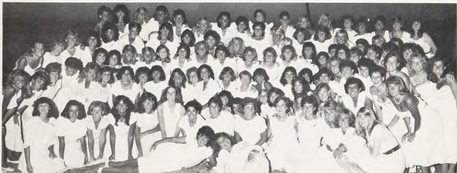
Delta Psi Chapter claimed Gamma Phi Beta's top chapter honor when it received the Mary A. Bingham Award for overall excellence.