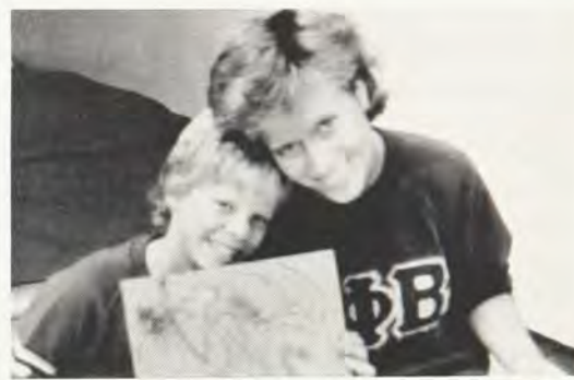
Love grows at Camp Sechelt.

Once there was a girl who was camping at Gamma Phi Beta camp. The girl's name was Rebeca. Rebecca was homesik. She cried every night without fale. One night a girl named Rosa heard her when she was going to the bathroom. Rosa asked Rebecca why she was crieing. Rebeca ansewred homesik and hid her head under her pillow. Rosa patted Rebbeca on the head, said she was homsik too. Rebeca didn't ansewe but stoped crying. the next day Rebecca was cheery and happy. she made a friend, that day Rosa asked to sit with Rebbeca. Recca said yes. Rebbeca and Rosa became best friends.