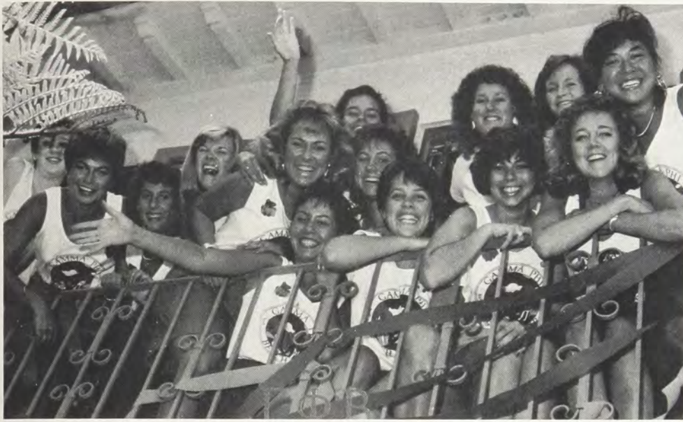
UCLA seniors show their enthusiasm on pledging day.