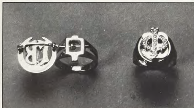
Sterling Silver $65.00

Pinning your badge into our ring or pendant is as easy as pinning it onto your blouse.