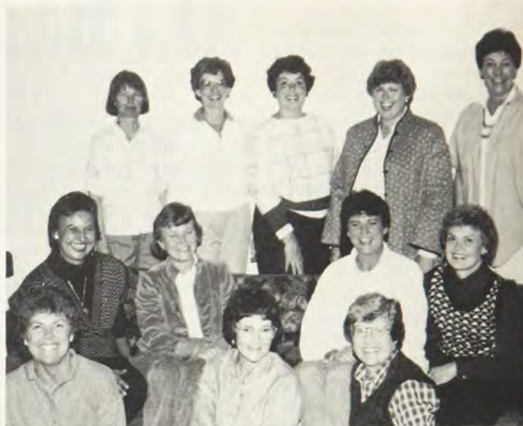
Beta Sigma Chapter (Washington St.) charter members get reacquainted at their reunion.