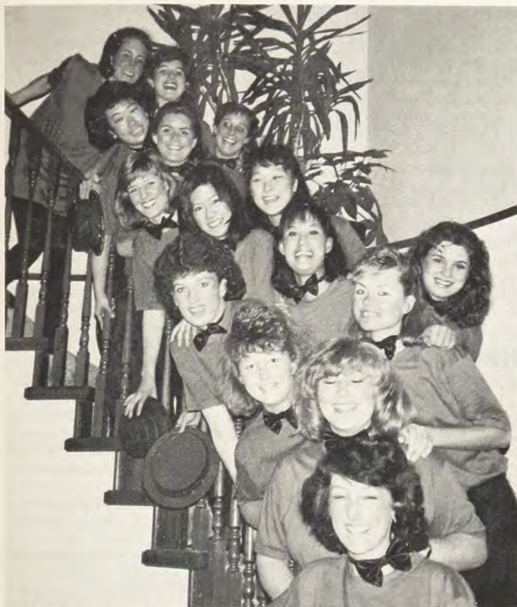
Alpha Lambda Chapter (British Columbia) members placed third in Songfest.