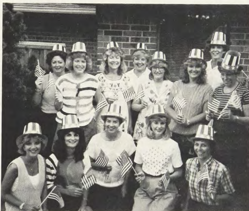
Norman, Okla. alumnae celebrate Independence Day.