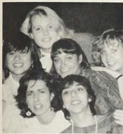
Alpha Alpha members celebrate Founders Day in Toronto.

chapter is fun-event-of-the-week at which members get together for a different activity each week.