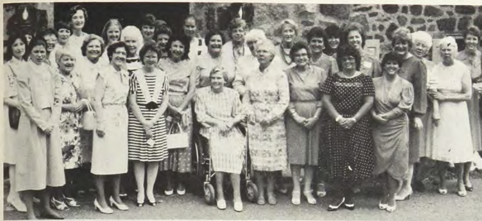
Philadelphia West Suburban alumnae celebrate their chapter's 50th anniversary.