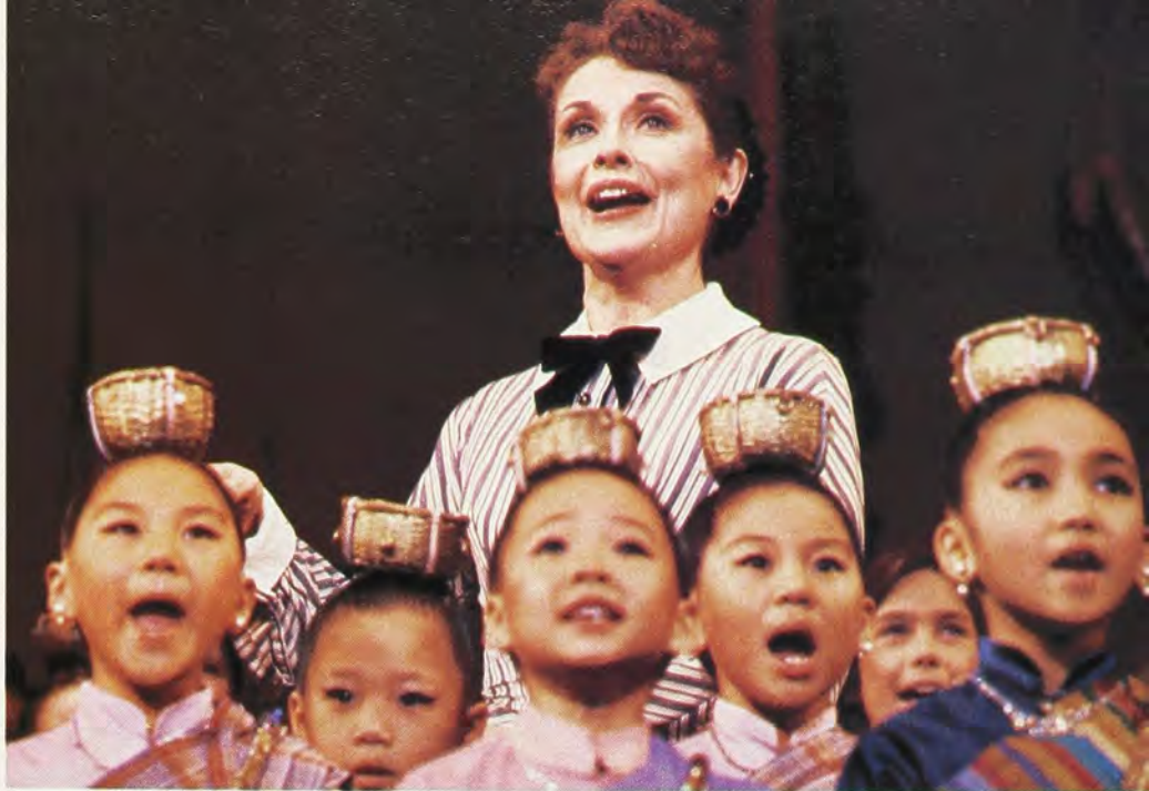
Mary Beth Peil describes her character, Anna, as "a tough cookie who is independent and strong."

"It was a wonderful feeling, and I had never felt that as an opera singer, always being very careful and afraid of overextending. I felt a whole shift in my physical and mental energies. I could use everything."