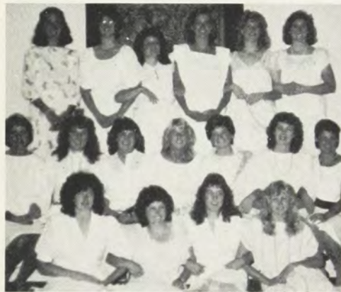
New Nevada sisters pose after formal pledging.