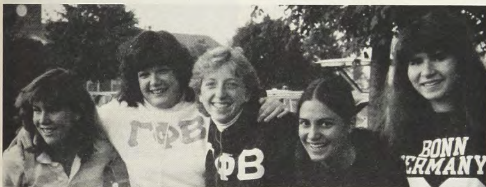
Bucknell Gamma Phi Betas cheer their teammates during Greek Week.