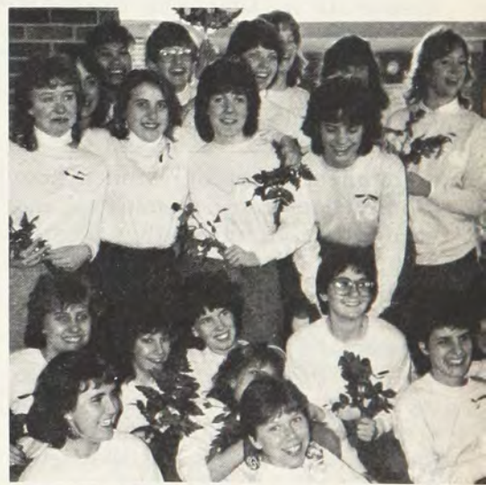
New pledges join Epsilon Beta Chapter at Alma.