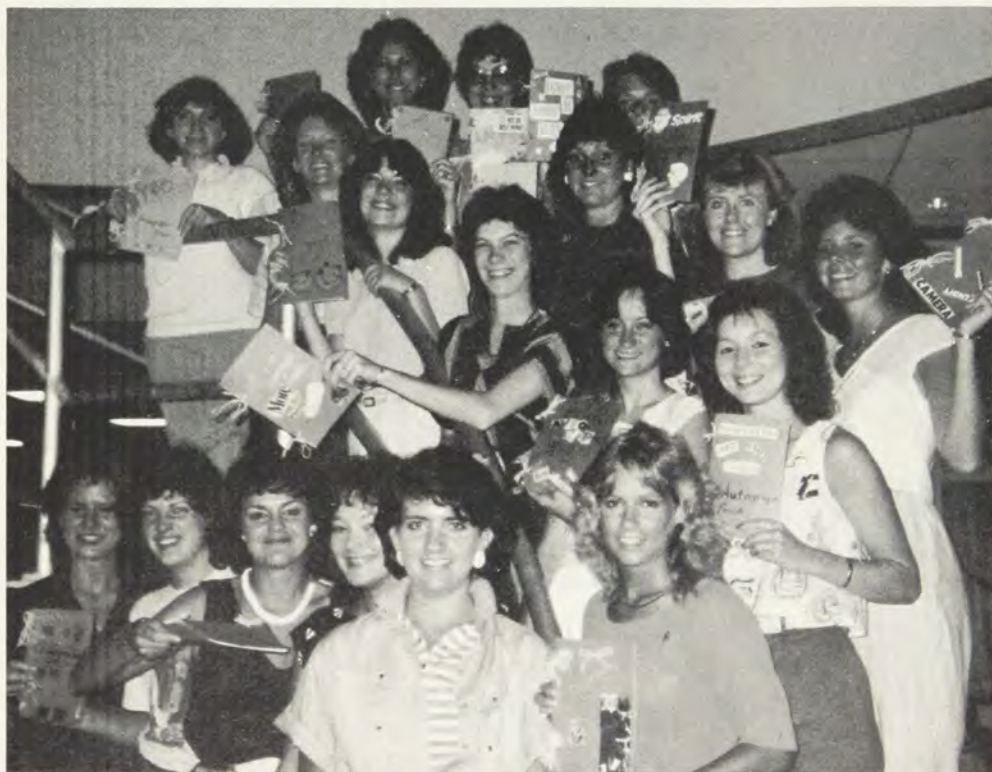
Autograph books from Delta Omicron at Southern Tech will delight Camp Sechelt campers.