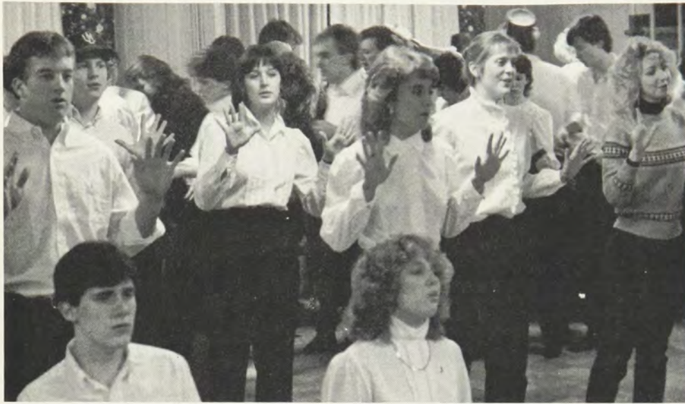
Indiana Gamma Phi Betas and Alpha Tau Omegas practice for I.U. Sing.