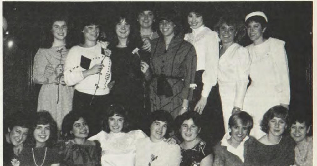
Phi Chapter members take time out from dancing in St. Louis.