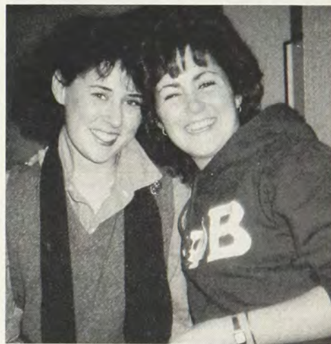
Sisters get together on bid day at Lehigh.