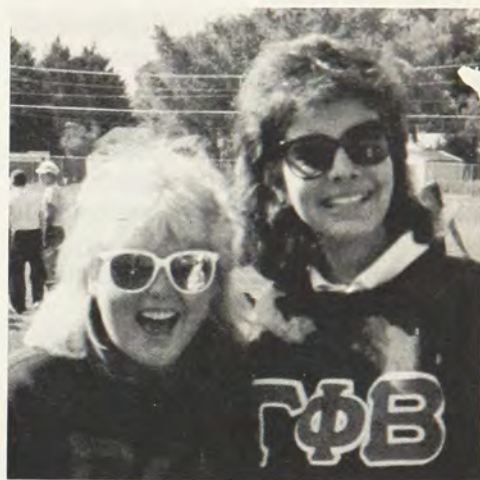
Denver Gamma Phi Betas enjoy Greek Olympics.