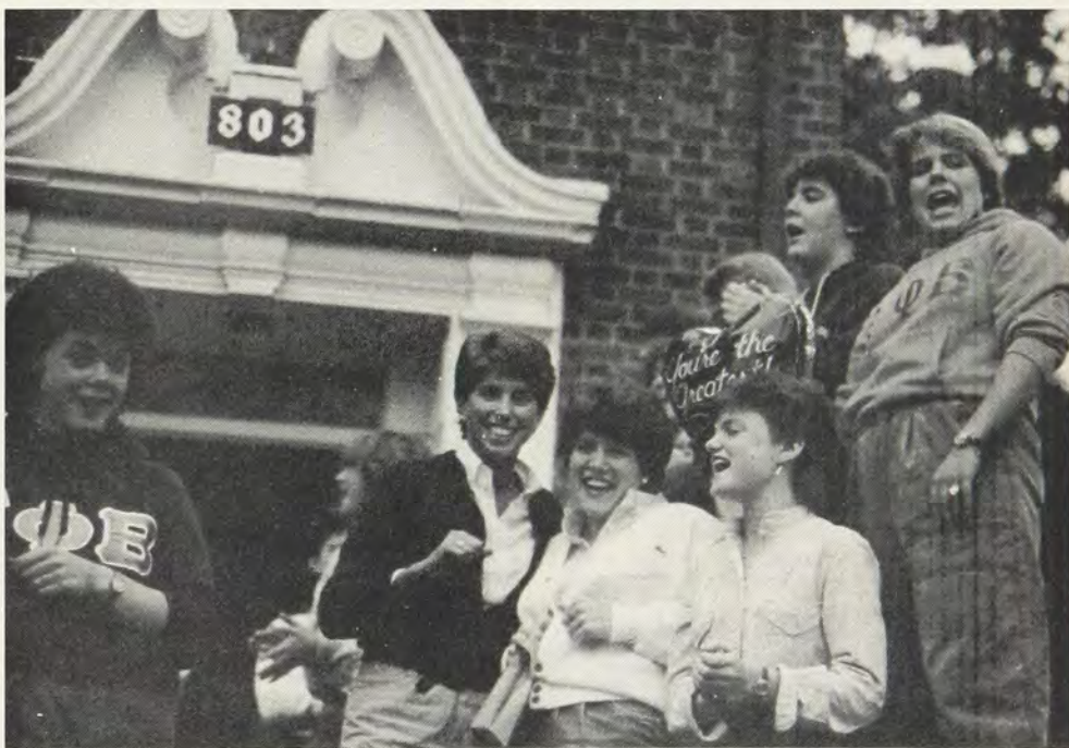
A fall day brings Gamma Phi Betas out on the front porch at Syracuse.

Greek Parents Day were events at Oakland. Chapter members went on a hay ride and picnic with Theta Chi.