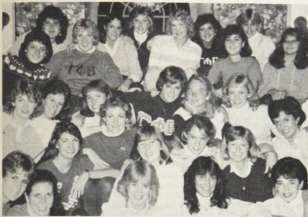
Bradley sisters meet on the stairs of the chapter house.