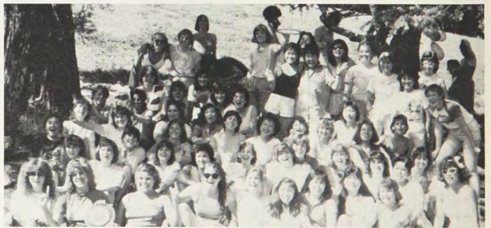
A sunny day is perfect picnic weather for California-Berkeley Gamma Phi Betas.