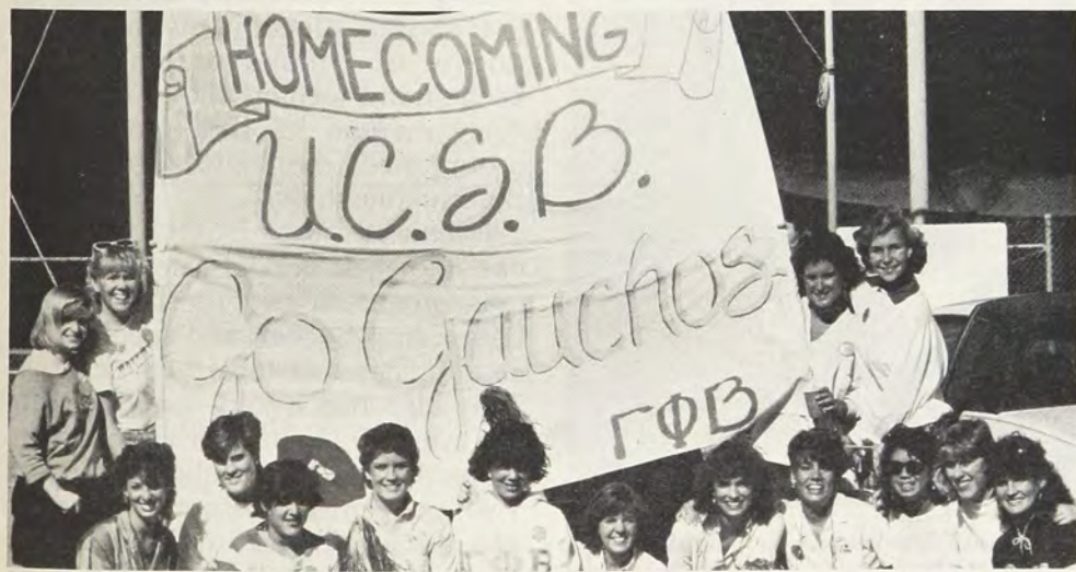
Chapter members display their banner For California-Santa Barbara Homecoming.