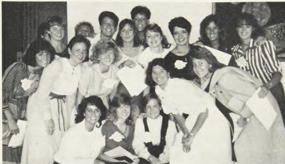
University of Arizona Gamma Phi Betas attend State Day.

The annual See-saw-athon was a success for Theta Chapter ( Denver ), as was its participation in the Alumni Telefund. A new program for the