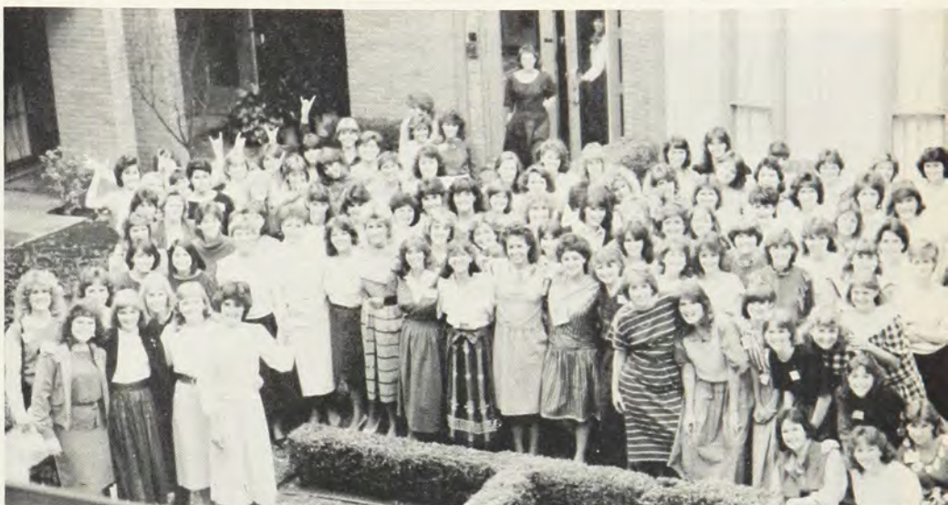
Gamma Phi Betas from eight chapters attend Area Leadership Conference at the U. of Texas.