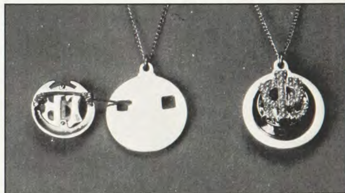
Sterling Silver $22.00