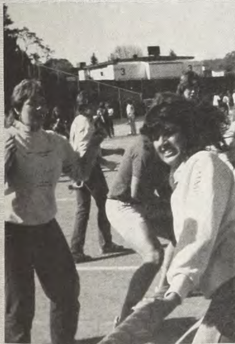
Oregon State sisters pull for the win in Derby Days competition.