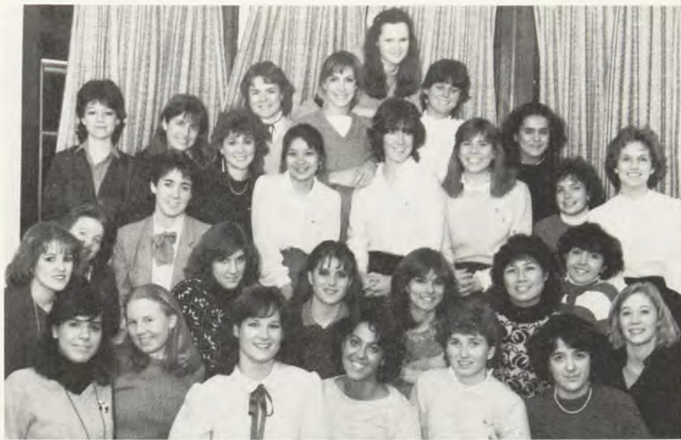
Alpha Tau Chapter at McGill University is the largest sorority chapter on campus.