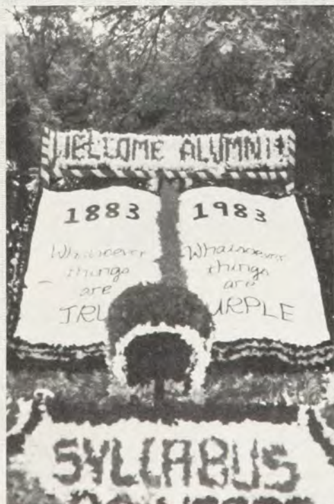
Northwestern Gamma Phi Betas won first place in Homecoming float competition.