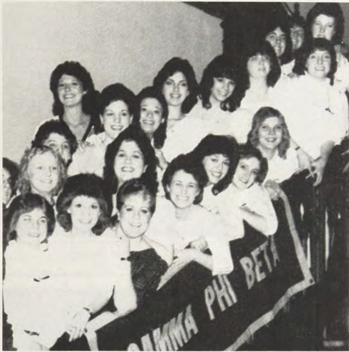
Delta Omega charter members display their new Gamma Phi Beta banner.