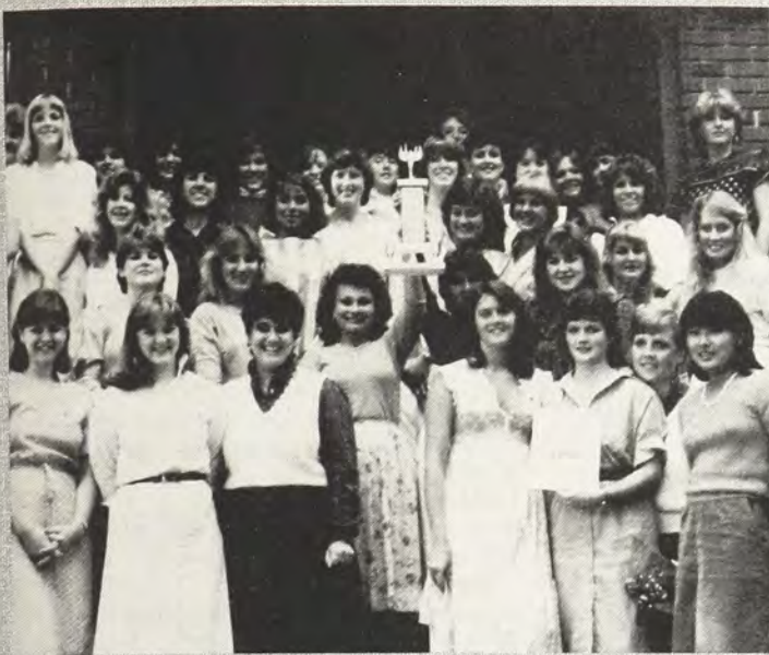
Nu Chapter Gamma Phi Betas are proud of the second place Greek Week trophy they won at the University of Oregon.