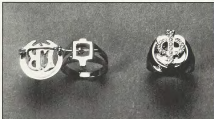
Sterling Silver $44.00

Pinning your badge into our ring or pendant is as easy as pinning it onto your blouse.