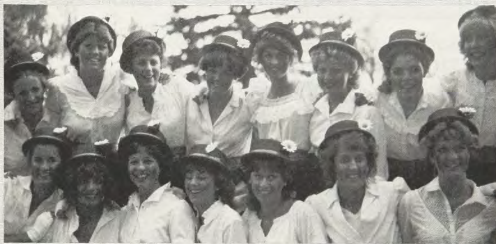
Washington State sisters placed fourth in Songfest.