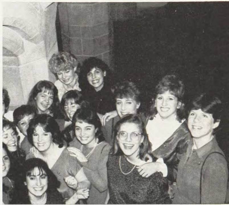
Alpha Omega Chapter members conducted the initiation service for Delta Omega.