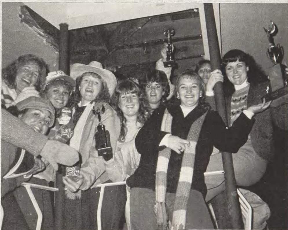
Alpha Gamma Chapter at the University of Nevada won three first place trophies for their participation in the Lambda Chi Alpha Thanksgiving food drive.