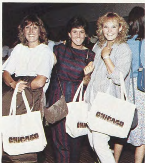
Gamma Phi Betas check in at Convention registration.