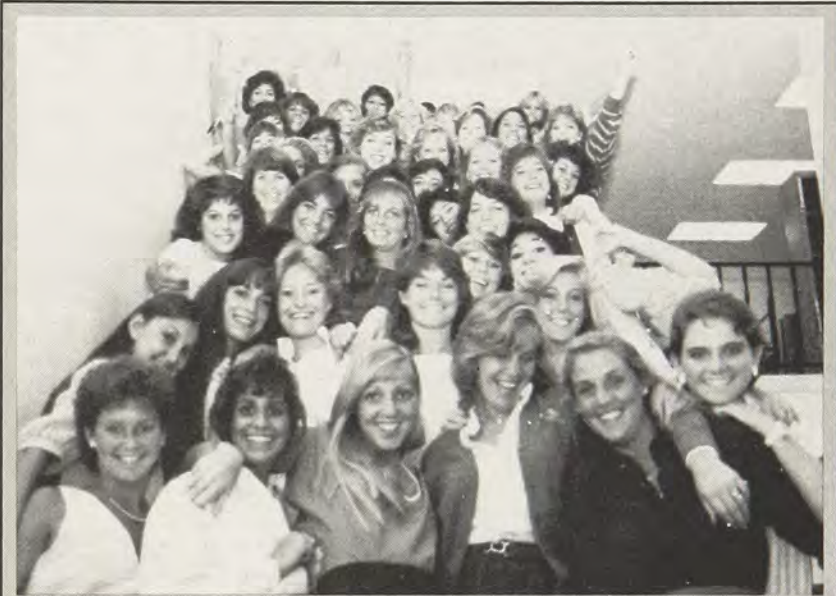
University of San Diego colony members are all smiles for Gamma Phi Beta.