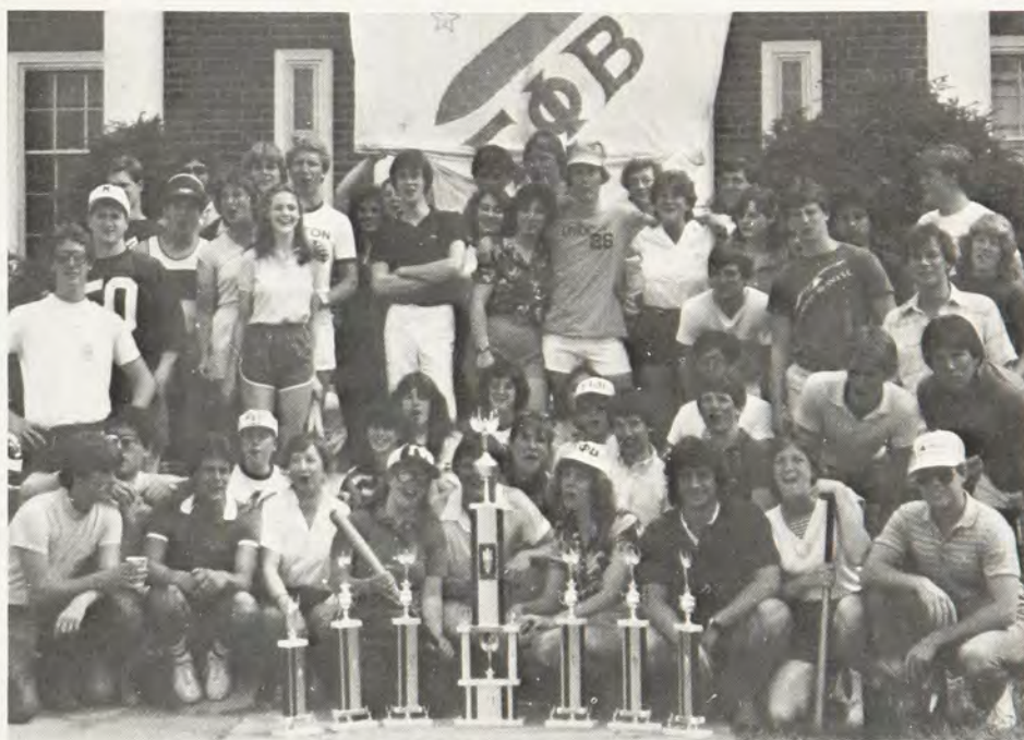
Gamma Phi Betas and Phi Gamma Deltas were the overall winners of University of Maryland Greek Week, capturing six first place trophies and one for second place.