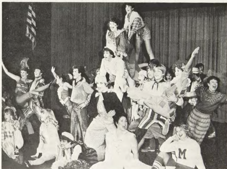
The Freshman Follies skit presented by Gamma Phi Betas and Delta Chis at Oklahoma State won second place.