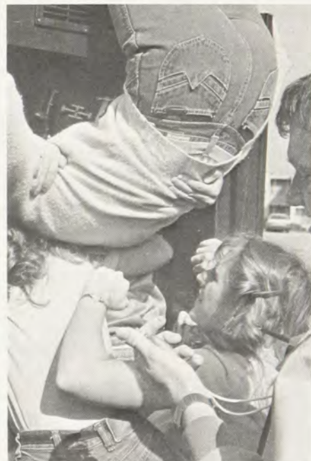
Sisterhood brings Texas Wesleyan collegians close together to win second place in the phone booth stuffing contest.