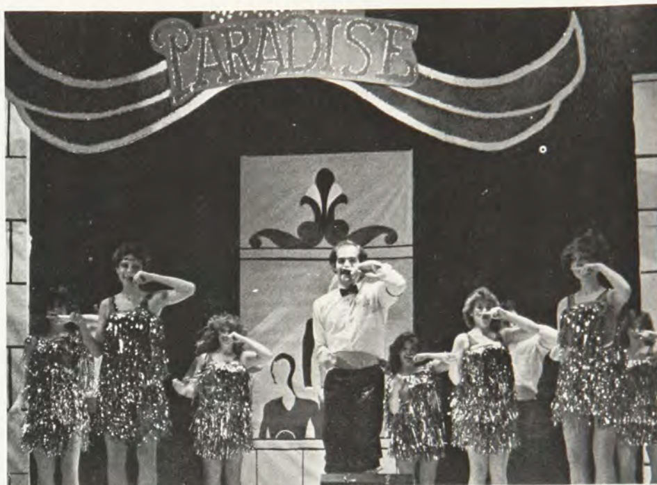
Chicago's Paradise Theater was the theme for the first place Campus Revue skit presented by Gamma Phi Betas, Sigma Nus and Sigma Pis at Indiana State.