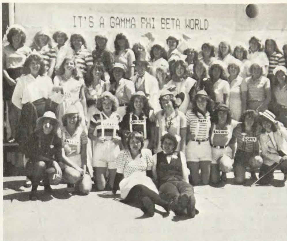
Disneyland Day, complete with the seven dwarfs, is a rush favorite at California State-Long Beach.