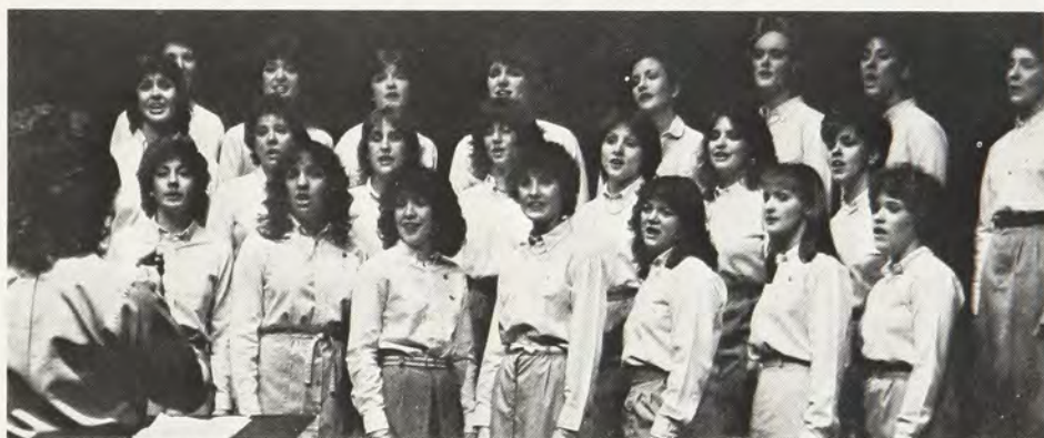
Beta Omicron Chapter members at Oklahoma City sing their way to second place in Spring Sing.