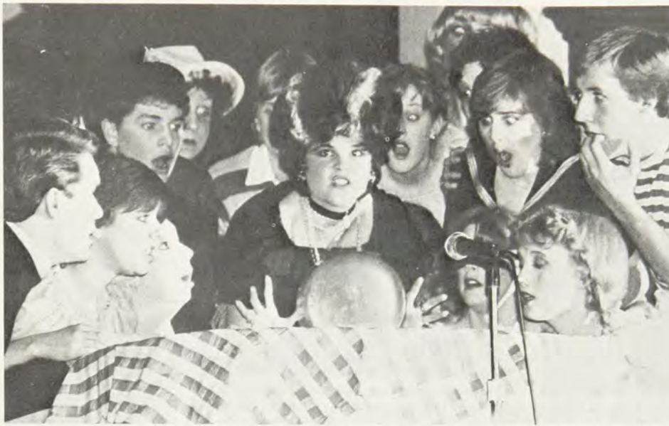
Iowa State Gamma Phi Betas and Delta Upsilon won first place with their Varieties Show skit.