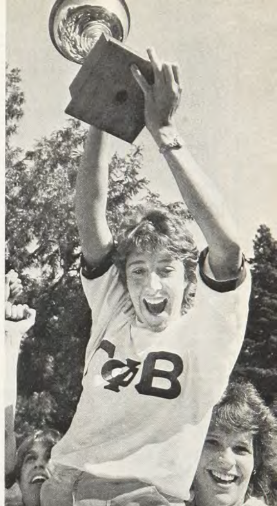
University of Idaho pledges capture the first place trophy in the Sigma Alpha Epsilon Olympics.