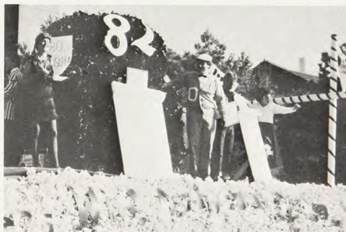
Gamma Phi Betas and Lambda Chi Alphas at the University of Oklahoma won second place for their Homecoming float.