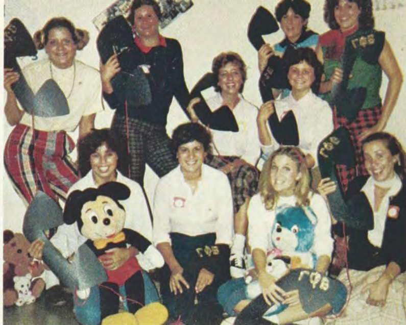
Rush at Illinois State includes a 50s skit complete with telephones and bobble sox.