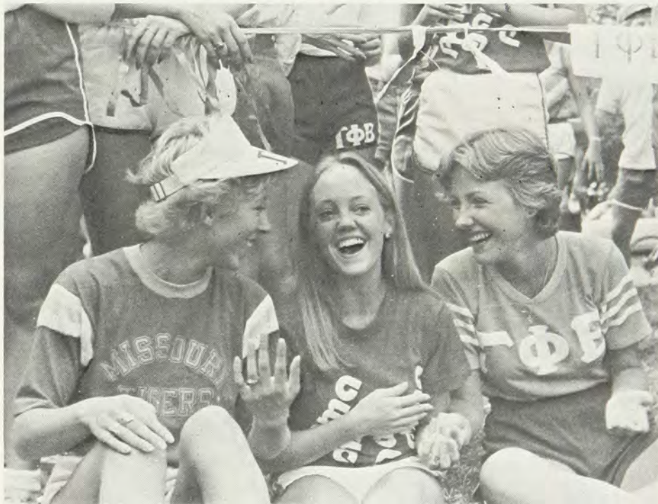
Alpha Deltas at Missouri are having a fun time at the Lambda Chi Alpha Watermelon Fest.