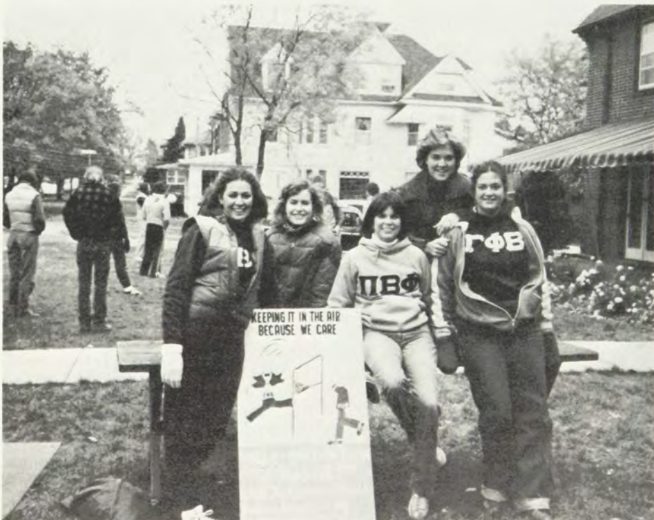
Iowa Gamma Phis and Pi Phis work together on a volleyball-a-thon to raise funds for charity.