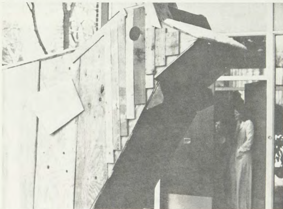
Washington State Gamma Phis awakened one morning to the sounds of this chicken built by Theta Chi Fraternity.