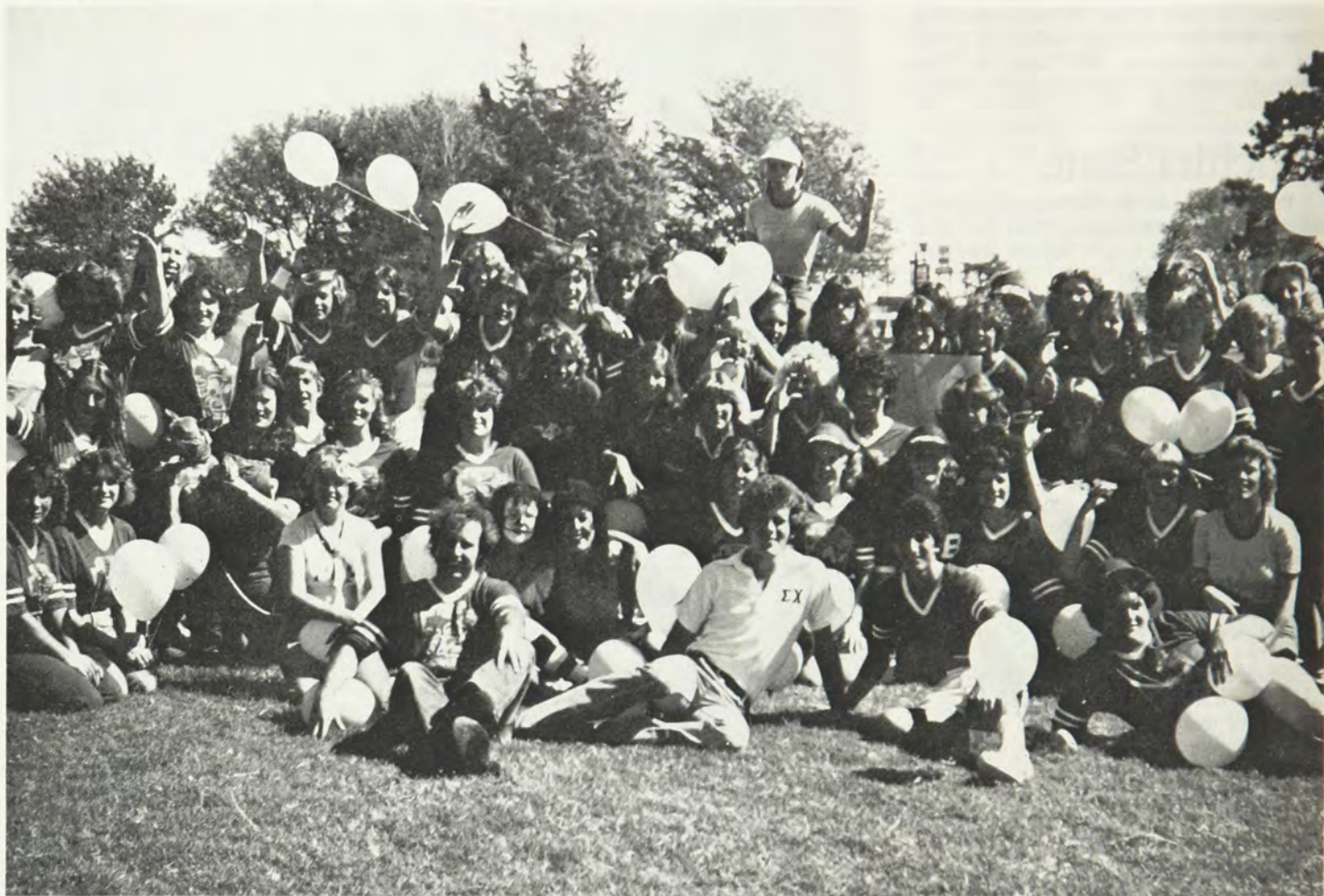
Beta Taus at Texas Tech pose with their Sigma Chi coaches before the start of Derby Days. Two members dressed as Raggedy Ann and Andy are the chapter mascots.