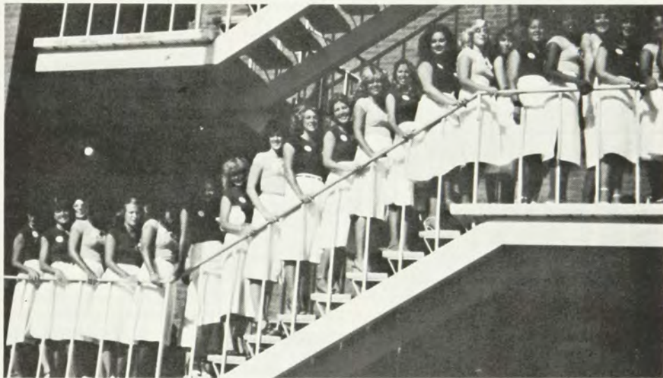
Arizona State Gamma Phis are ready for rush to begin.