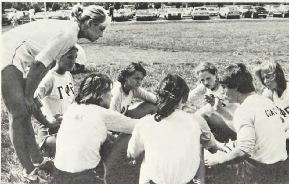
The Kansas Gamma Phi football team huddles around their coach at halftime.