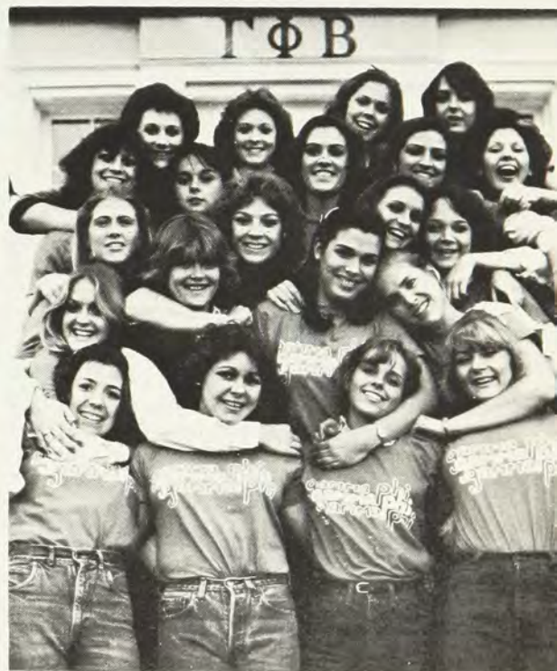
... the 1981 pledge class at the University of Kansas.

Alpha Chi Chapter at William and Mary welcomed their pledges after fall rush. They give rushees a taste of Gamma Phi Beta during house night, skit night and preference night.