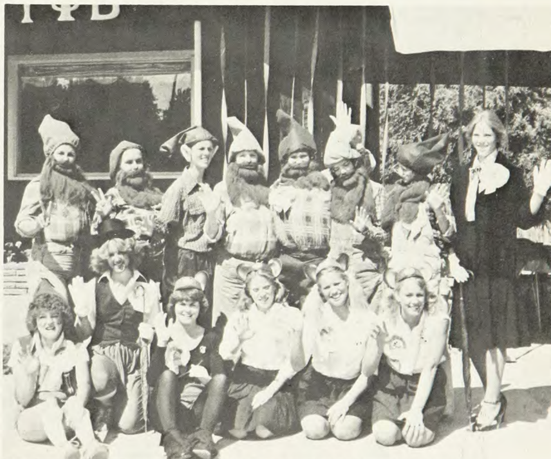
Boise State Gamma Phis wave a big hello to rushees invited to the Disneyland rush party.