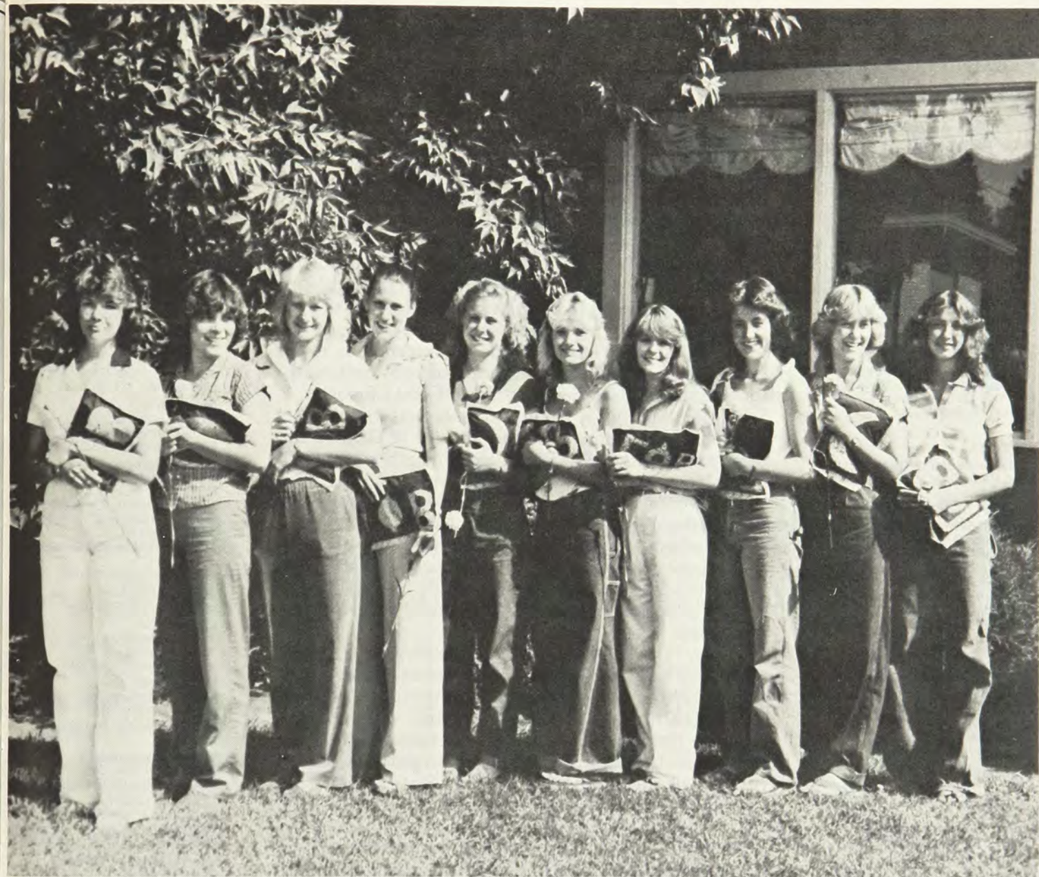
Pink carnations in hand, these Boise State pledges are happy to be Gamma Phi Betas.