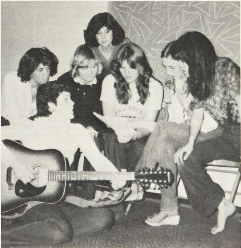
Fall pledges learn a song during Inspiration Week at California-Riverside.