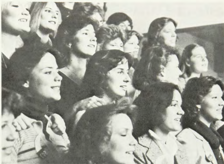
Singing to greet rushees are Beta Etas at Bradley.