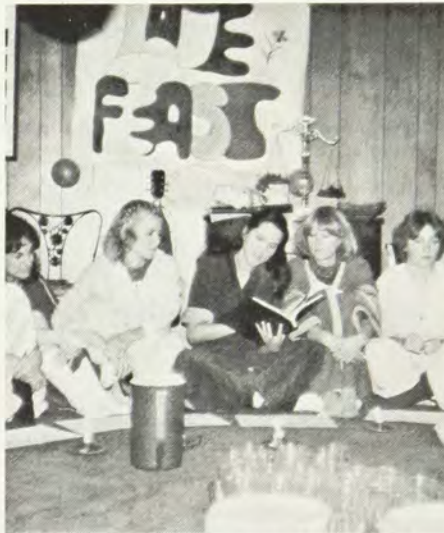
North Dakota Gamma Phi Betas share their love at a love feast during Inspiration Week.

Gamma Phis were honored when the Panhellenic scholarship standings showed our chapter as third out of 13 sororities. The year ended with the traditional senior