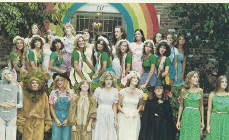
The Wizard of Oz comes alive on theme day at the University of Southern California.