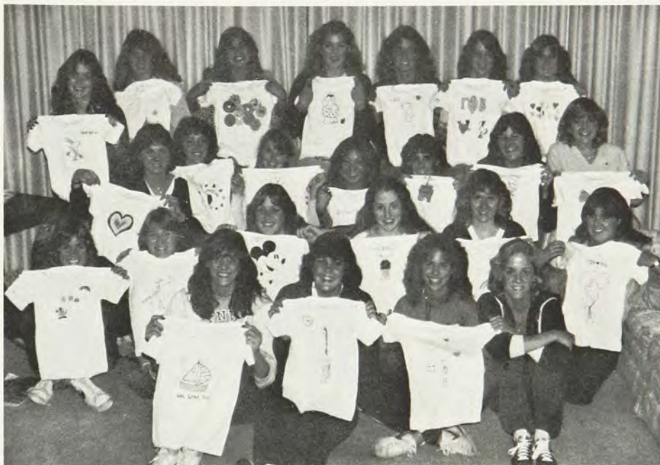
New pledges at Cal. Poly-San Luis Obispo display their T-shirts.

Beta Rho participated in many campus activities last spring. We had a Valentine party with a new sorority on campus and two fraternities and a Sunday brunch for