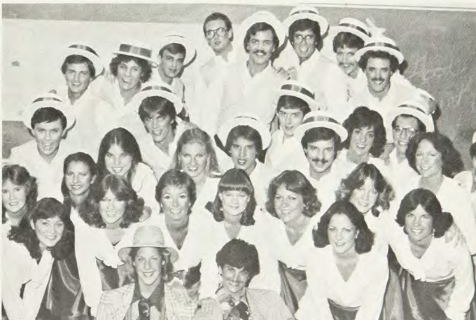
Oklahoma Gamma Phi Betas, Sigma Chis and Lambda Chi Alphas sing their way into first place during university sing.