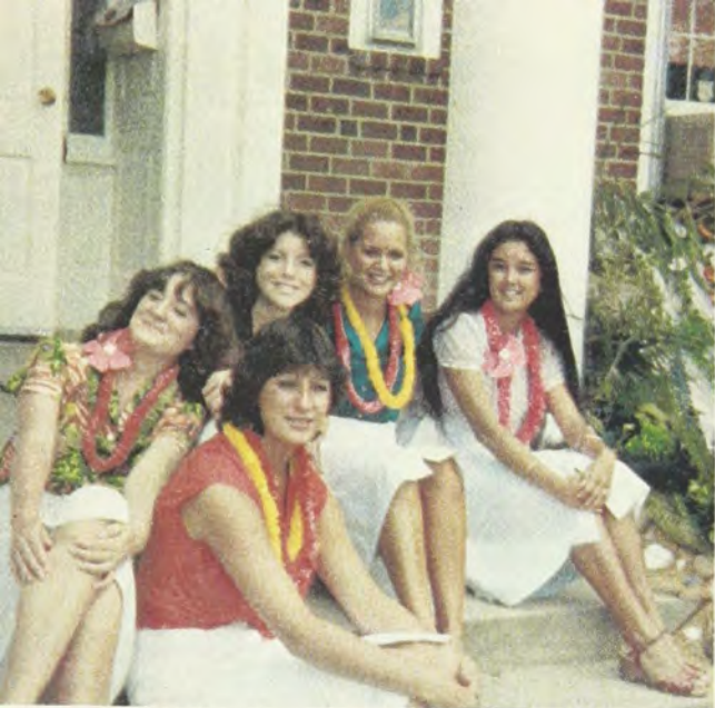
University of Maryland Gamma Phis prepare to welcome rushees to a Hawaiian party.