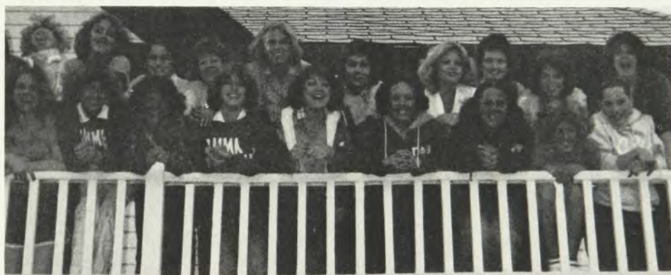
Kearney State Gamma Phi taking a break during rush.