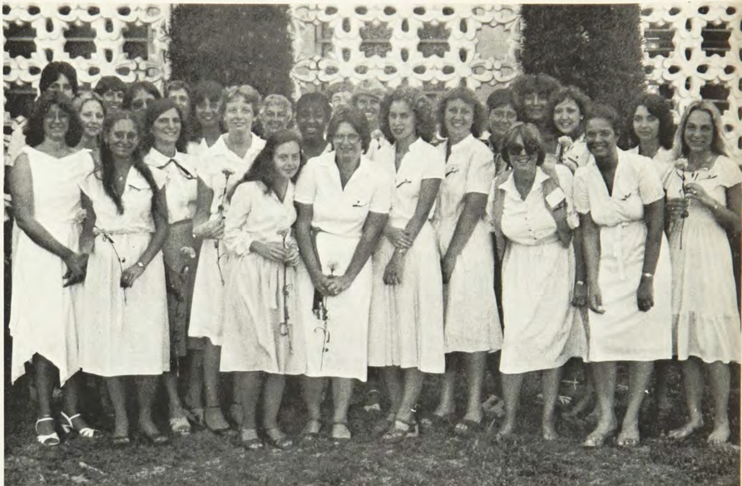
Gamma Phi Beta's newest colony, Delta Sigma, will be installed at Florida Institute of Technology.