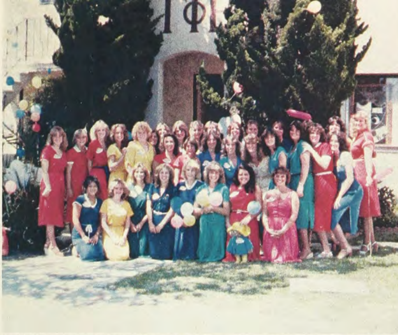
At California State-Long Beach, the Gamma Phis are ready to rush on rainbow day.