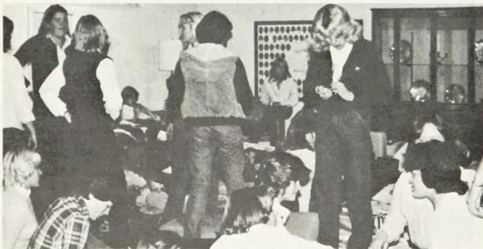
Kansas State pledges visit with Beta Psi pledges at the Oklahoma State chapter house.

pionship playoffs, more than 17 Gamma Phis contributed to the victorious season. We rank fourth out of 17 sororities in intramural sports points.