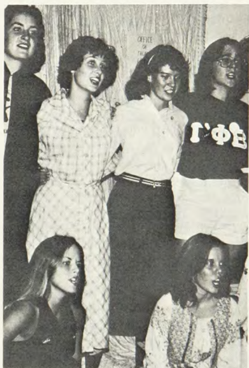
Gamma Phis at William and Mary present a rush skit.