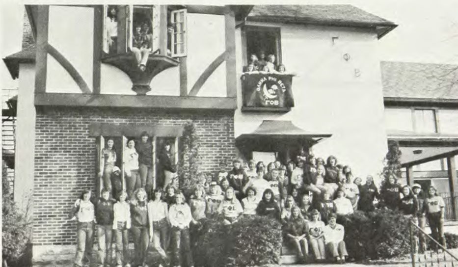
Wittenberg Gamma Phis pose in front of their chapter house.