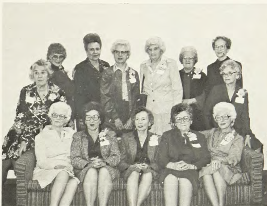
These Alpha Omicron charter members attended the 50 year celebration at North Dakota State.