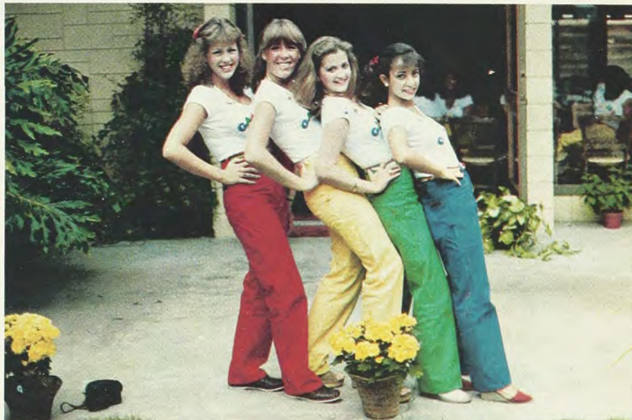
Colorful painters pants set the mood for the second day of rush at San Diego State.