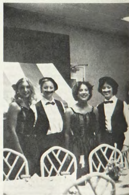
Delta Iotas at Purdue transform their dining room into a French cafe for a rush party.