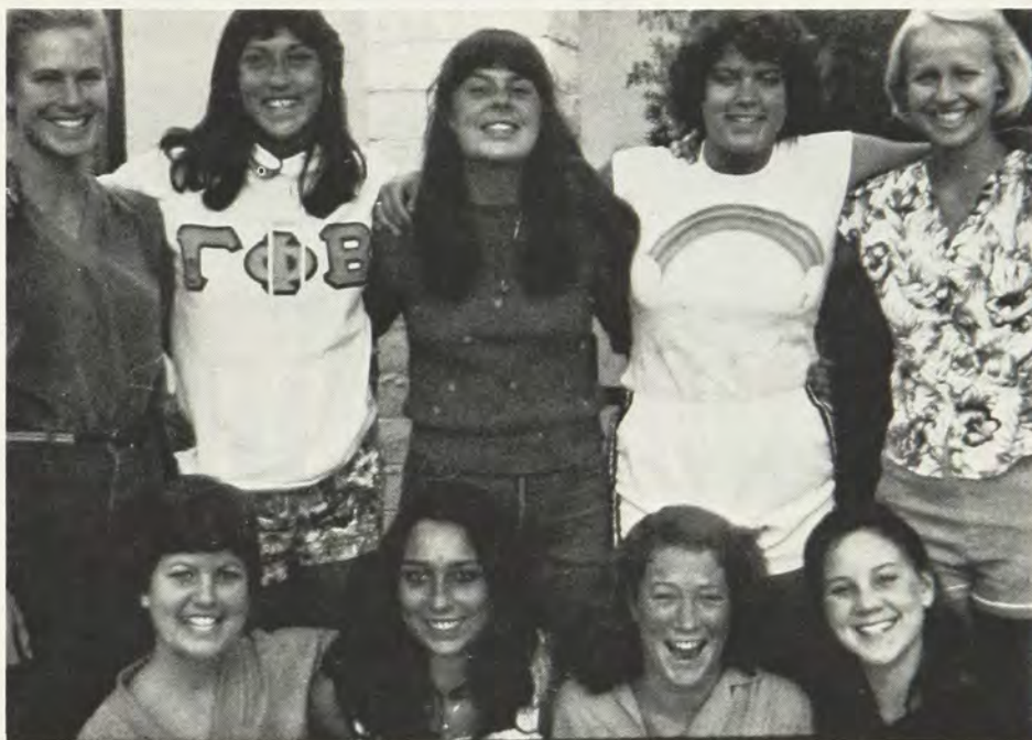
Delta Etas at California-Irvine are ready for more fun at their annual rush retreat.