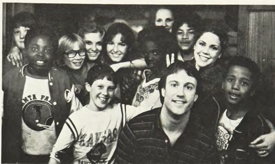
Kansas Gamma Phi Betas and Phi Delta Thetas delight the Lawrence Boy's Club with an evening of roller skating, punch and ice cream.

Gamma Phi Betas at the University of Arizona sponsor a Halloween party for children from a local orphanage. Chapter members decorate trick or treat bags for the children and take the orphans to booths and games set up in the dining room.