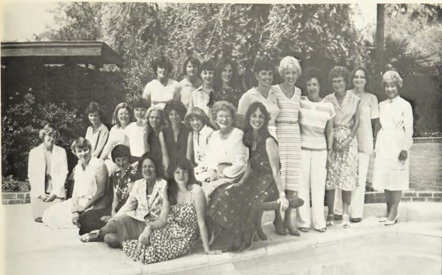
The fun will have just begun when the 1982 Convention Committee greets you in Phoenix in July. They have planned time for stimulating workshops, beautiful banquets and a trip to the Grand Canyon.