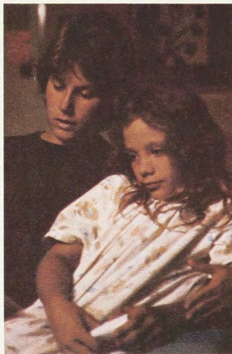
A counselor and a camper find that a big chair makes a cozy nest for a bedtime story.