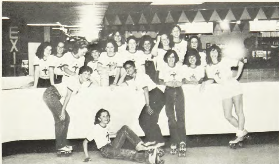
Nearly all the sisters stay on their feet at the skate-a-thon sponsored by Gamma Phi Betas at Wichita State.