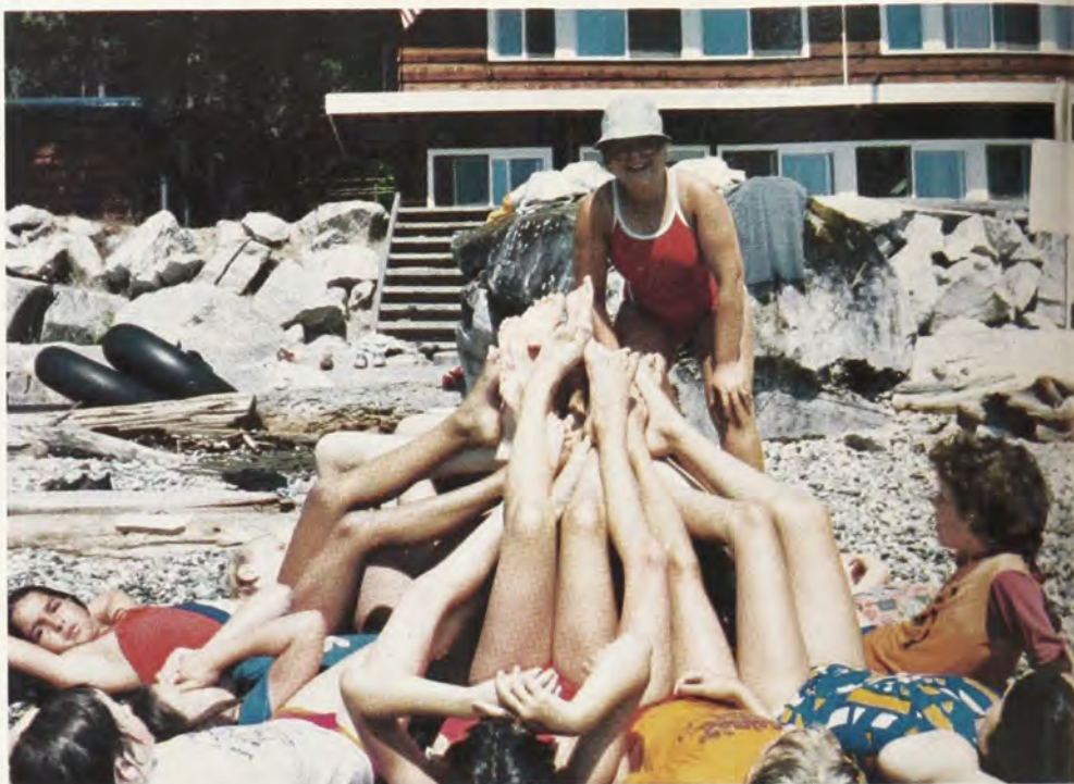
Campers take a rest on the beach in the warm sun after swimming lessons at Camp Sechelt.