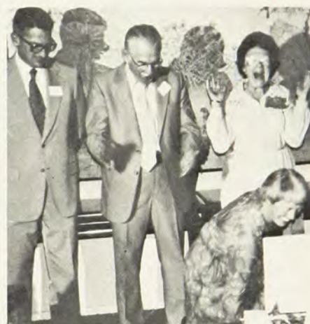
Alumnae and visitors watch as the chapter house mortgage is burned at Colorado State.

with a potluck at the house to admire the fruits of their labors.