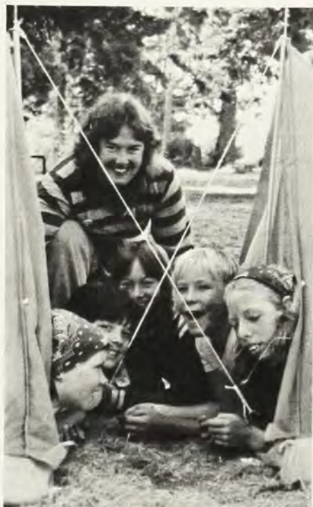
Camper get acquainted with their counselor under the pines at Camp Sechelt.

Now as we look to the future and what our role in camping is to be, we find a renewed commitment among Gamma Phi Betas all over the country. This past year the Gamma Phi Beta Foundation donated more than $5,000 in camper-