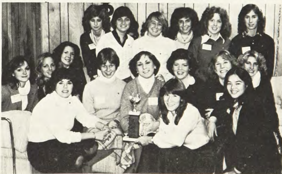
The Beta Eta pledge class at Bradley displays their first place philanthropy trophy.