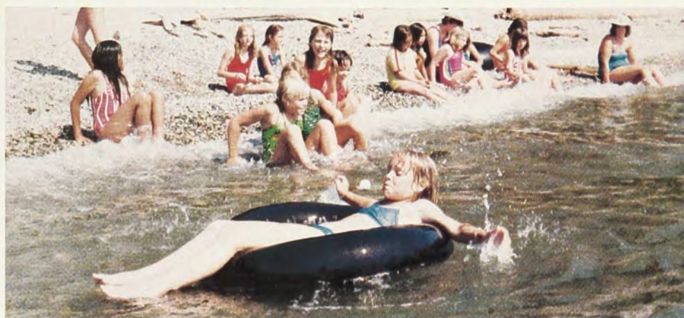
Splashing in an inner tube is only one of the carefree activities planned for campers getting away from the city.