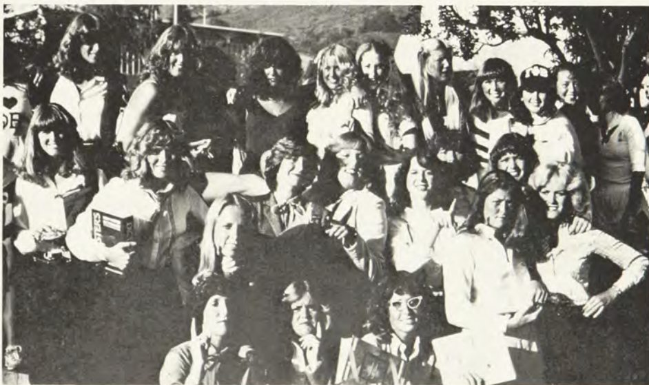
Gamma Phi Betas at California Polytechnic prepare to do their sweepstakes winning performance in the Greek Sing competition.

Kappa Chapter members participated in the University of Minnesota Campus Carni. Proceeds from the event go to the Carni Youth Project. They joined Chi Psi Fraternity in presenting one of 16 shows. Much effort went into building a set, and learning lines and dances for the presentation about castaways on a desert isle. The event, held in the fieldhouse, also featured food and game booths.