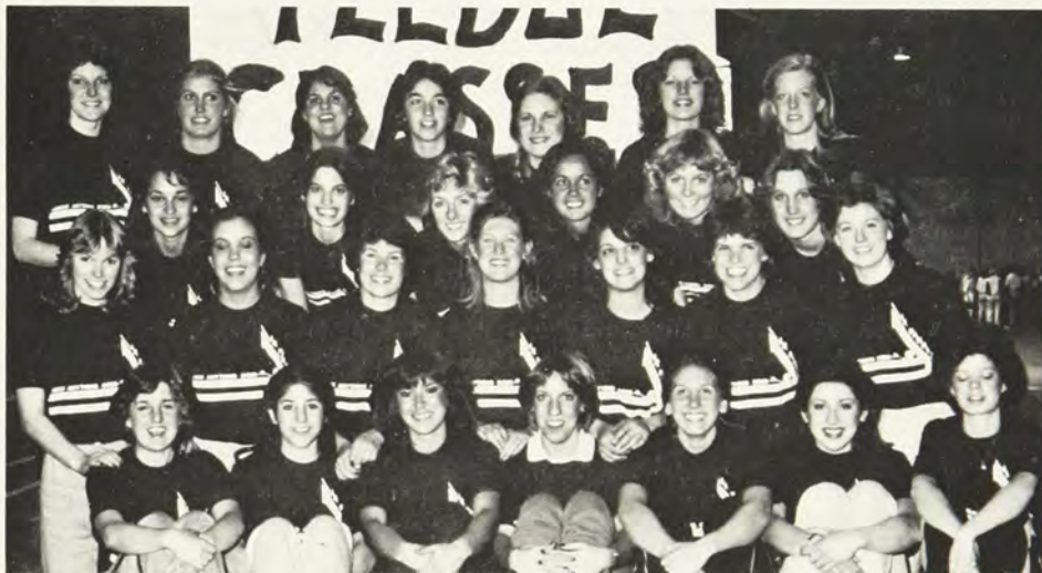
Purdue pledges prepare to show their spirit in the Almost Anything Goes Contest sponsored by Jr. Panhellenic.