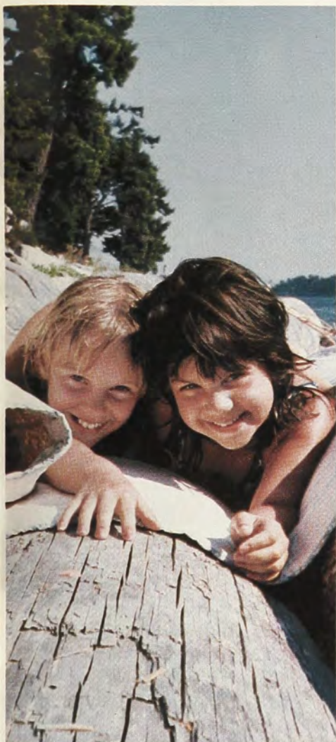
Logs on the beach make a comfortable napping place for campers enjoying the sunshine.