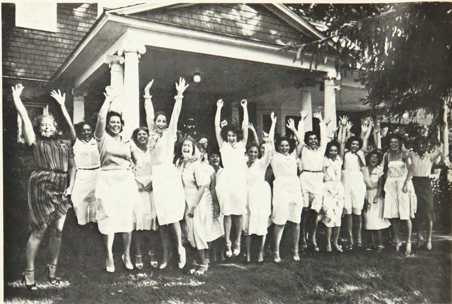
In front of Merrill House, colony members leap for joy in celebration of their pledging.