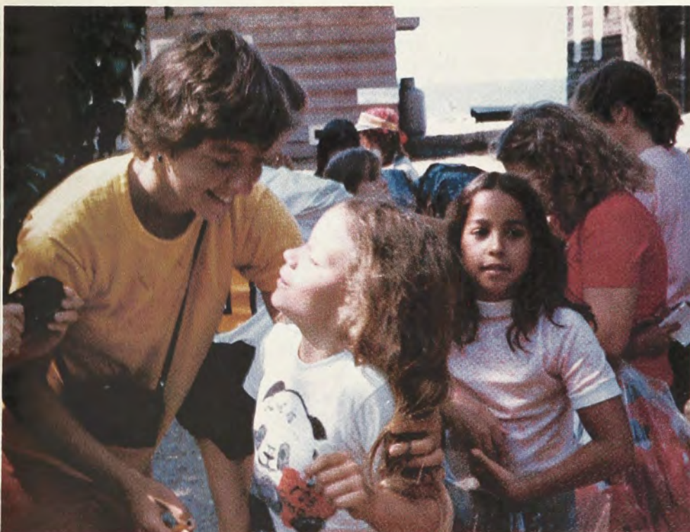
A big hug is sometimes just what a camper needs to brighten her day.