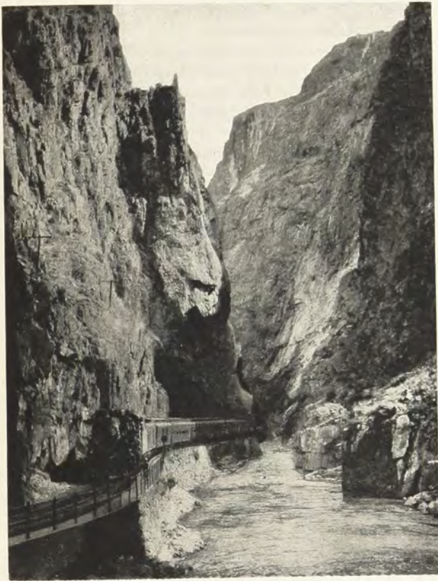
Majestic view of Royal Gorge, Colorado, at left