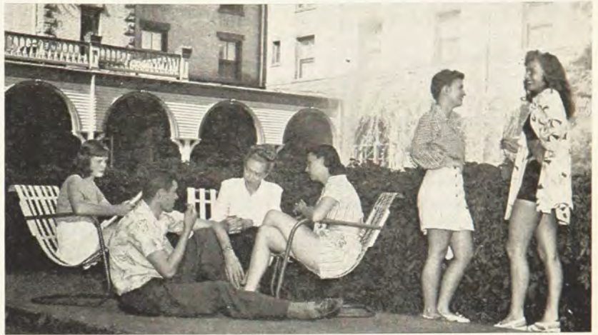
Lazing in the sun on the terrace, Hotel Colorado