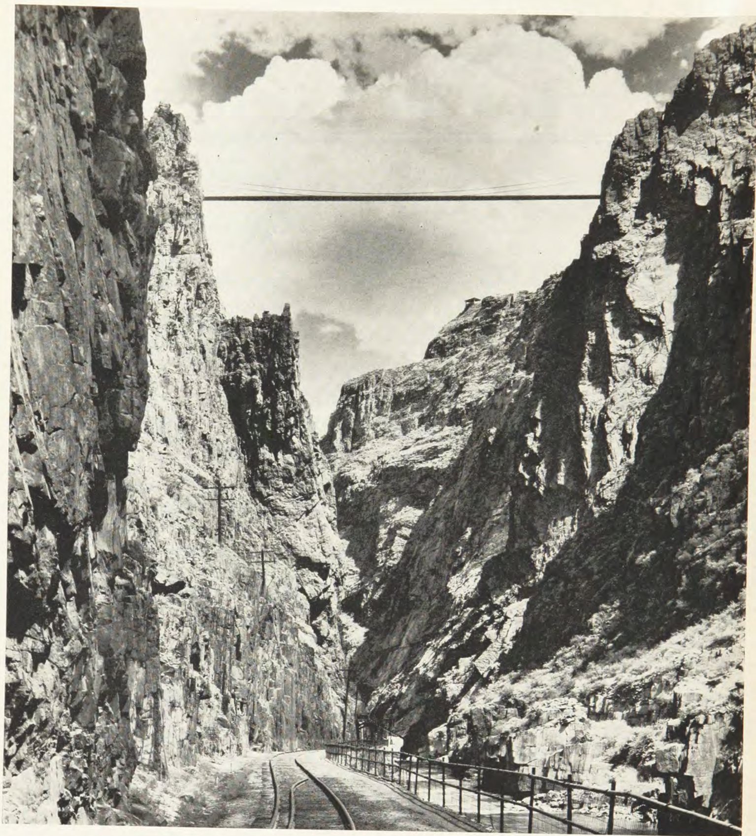
SCENIC SPLENDOR surrounds site of Gamma Phi Beta's 44th International Convention at Glenwood Springs, Colorado, June 22 to 28. A view of Colorado's famed Royal Gorge.