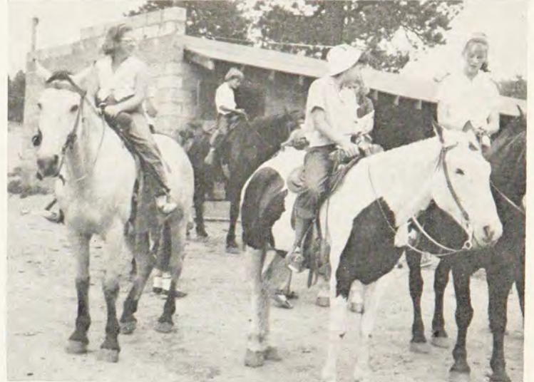
EVERYBODY MOUNTED? We're off for a western trail ride in Colorado where the Indian Hills camp offers fun, fresh air and friendship.