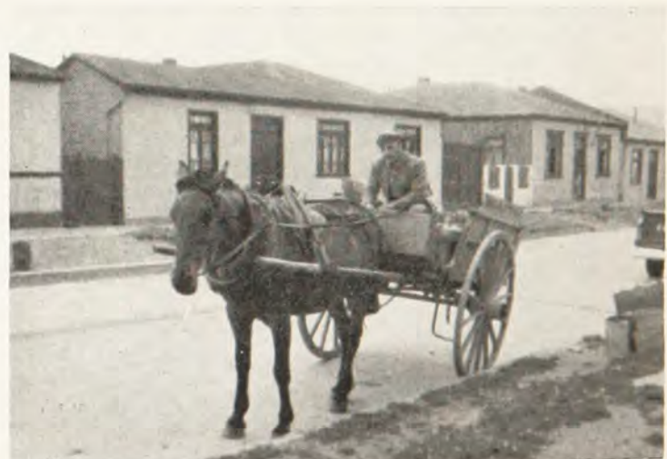
"My mailman cometh in a two-wheeled cart!"