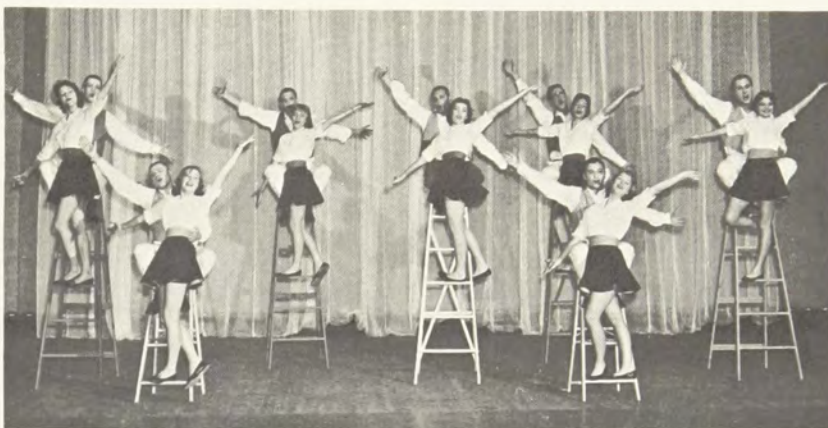
Annual Humorology show at the University of Wisconsin found the Gamma Phis teamed with the Chi Psis, a winning combination which received awards for Best Costumes and Best Scenery.