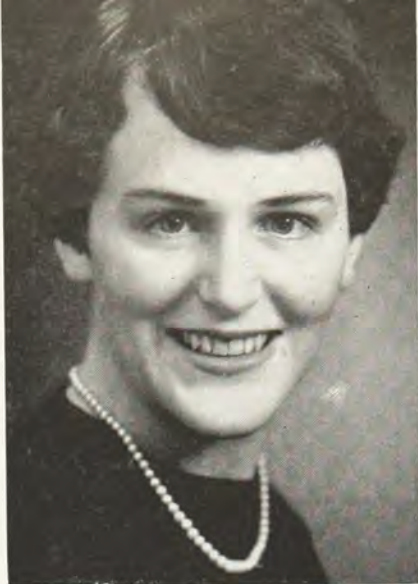
MORTAR BOARD MEMBER