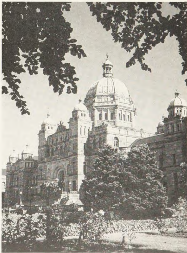
A "must" on your list of places to see in Victoria is the Parliament Buildings, within walking distance of the Empress Hotel.

Can't wait for summer! We'll see you at The Empress!