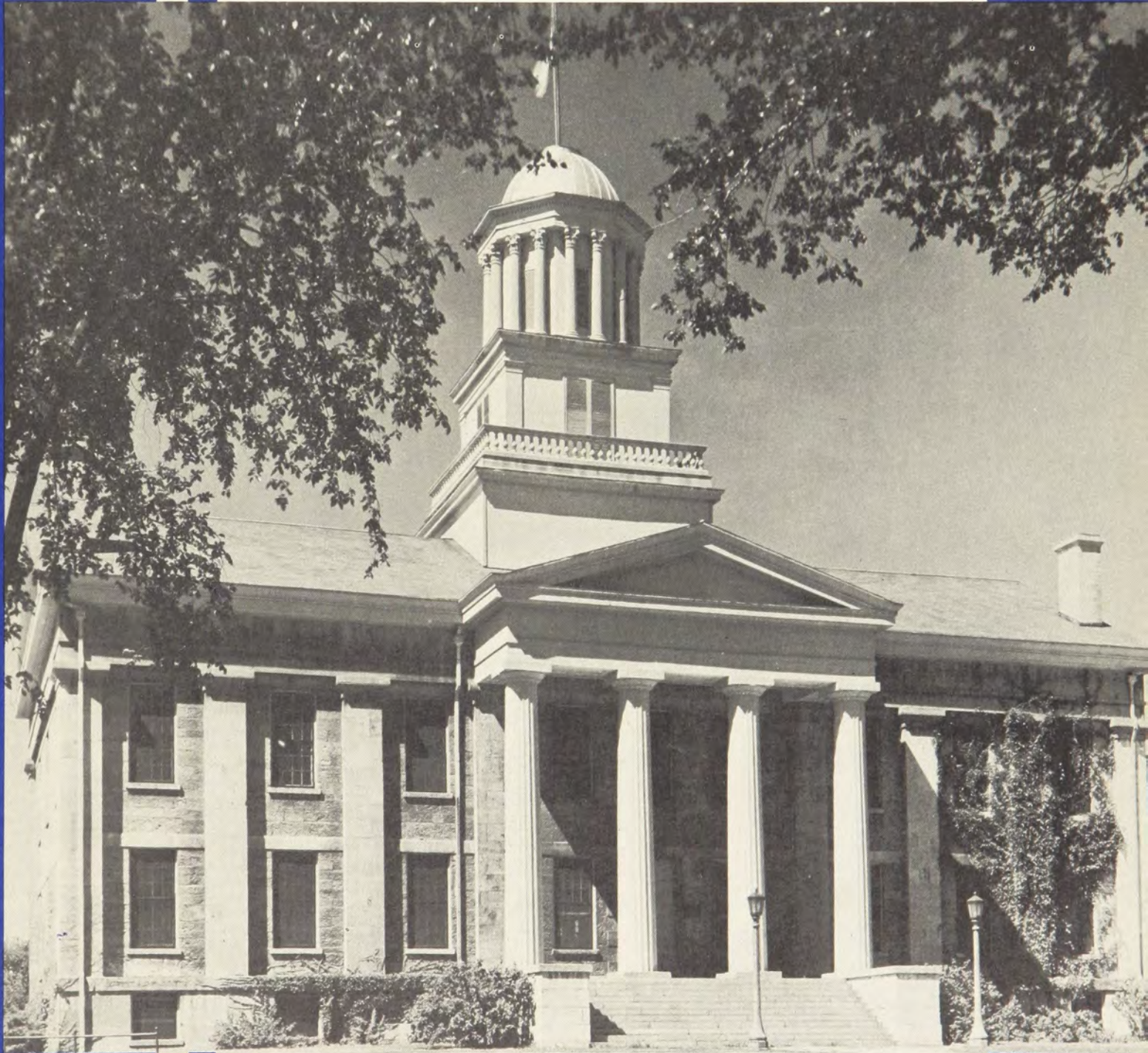
OLD CAPITOL, STATE UNIVERSITY OF IOWA