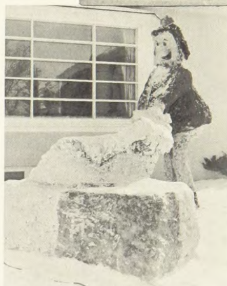
First place in the Snow Sculpture contest at North Dakota State went to Gamma Phi Beta for their model of Little Lulu.