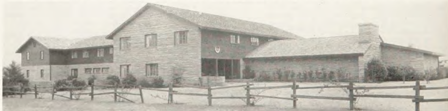
Psi chapter house at Oklahoma University, showing new wing added (left end) to increase accommodations. The wing, which is at the rear of the house, has room for twenty girls. It matches the modern ranch style house of stone and California redwood. Finished in bright colors, four rooms of the wing are furnished for two girls each. The larger rooms accommodate three girls.

Chapter won first place in the annual Penny Carnival; All Sports Trophy of the Women's Recreation Association.