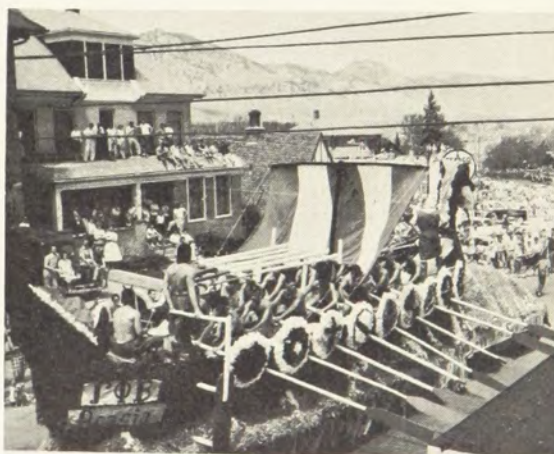
Gamma Phi Beta and Acacia fraternity worked together to create an elaborate float for C.U. days at the University of Colorado. It was titled, "Saga of the Sea Serpent" and was awarded first place in the Diamond Division.