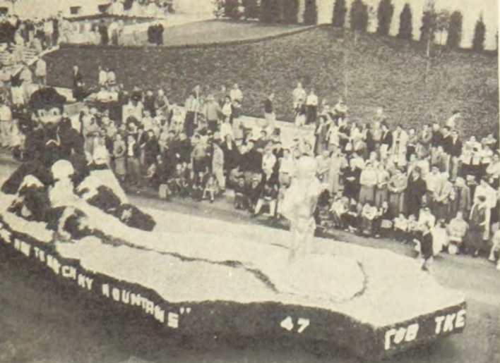
Top: Eta chapter's homecoming float which won first prize for beauty is captioned "Bring Me Men to Match My Mountains" and depicts a miner sitting on top of the mountains with a pan from which flows a golden stream terminating in a football player.