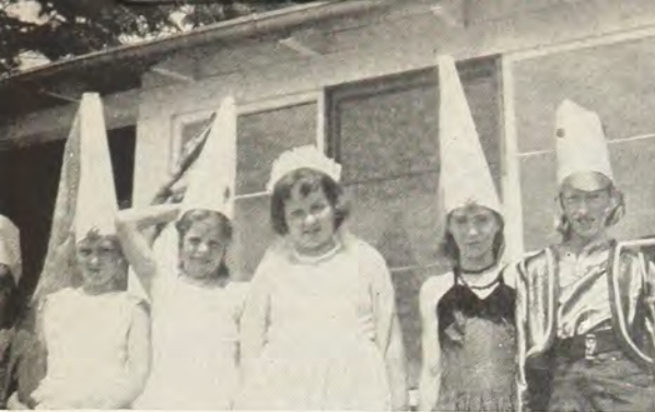
Dress rehearsal for the "Seven Princesses" at Sechelt camp, 1954.