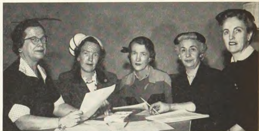
Philanthropy Board Meets