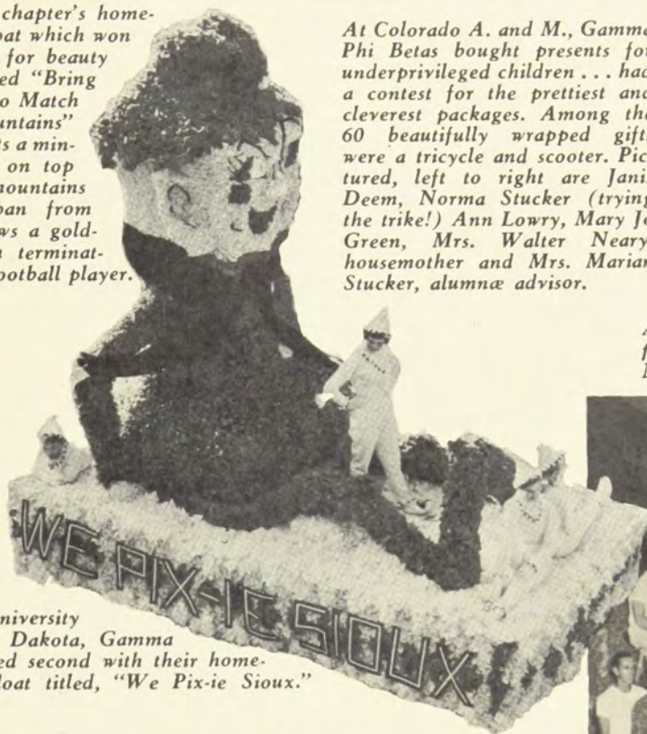
At the University of North Dakota, Gamma Phis placed second with their homecoming float titled, "We Pix-ie Sioux."