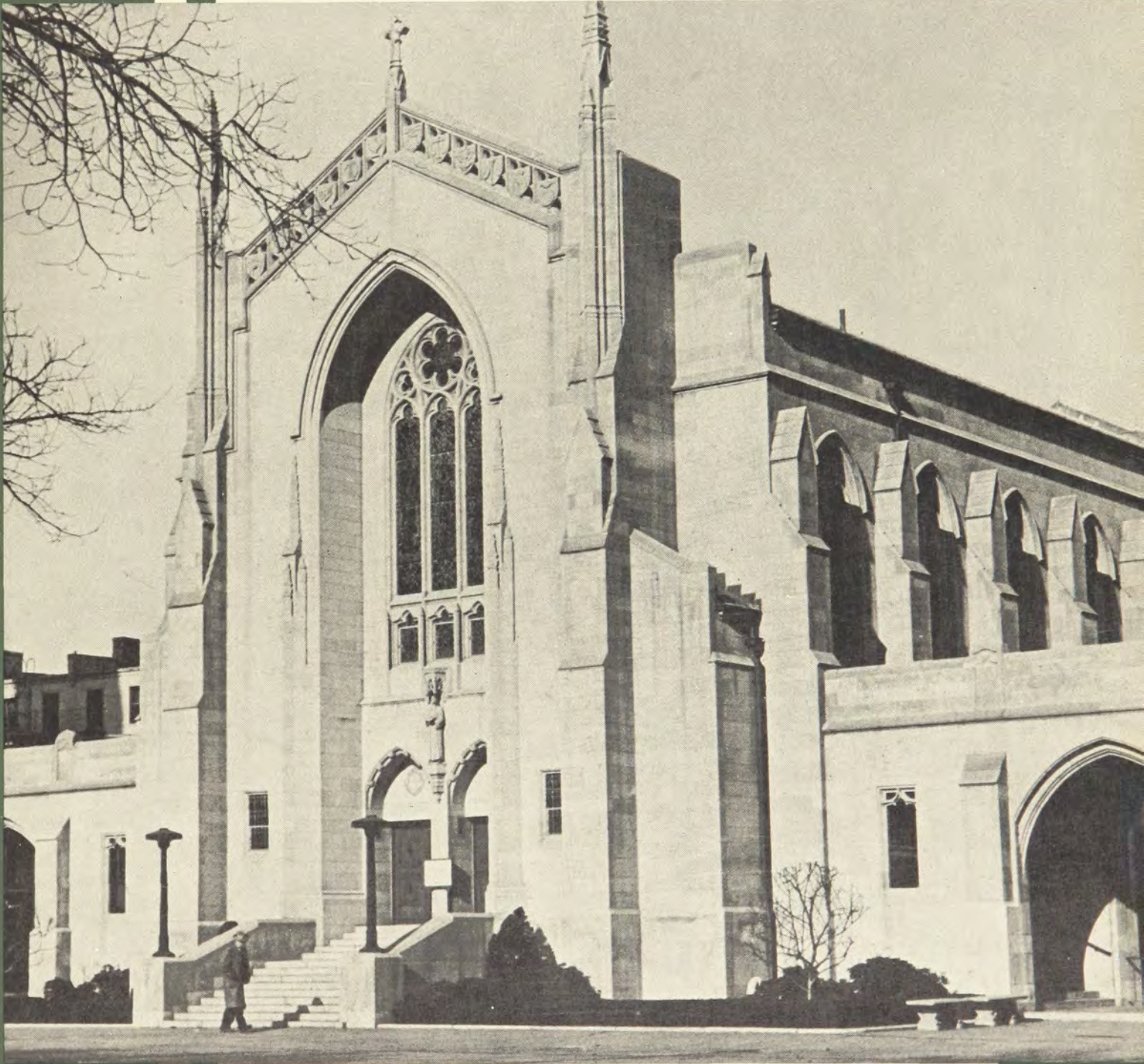
DANIEL L. MARSH CHAPEL AT BOSTON UNIVERSITY