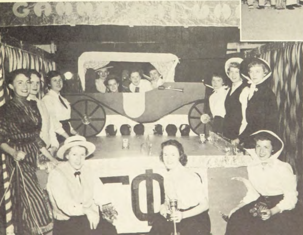
Pledges at Nebraska took first place in the Penny Carnival with their "Roll a Mobile for a Gamma Phi Wheel." Contestants aimed tiny cars at holes in Gay '90's Ford. If successful, a quartette of Gamma Phis appeared to sing, "Give me a ride, will you, Hon?"